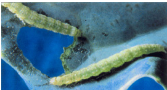
Figure 3. Large caterpillars of diamondback moth