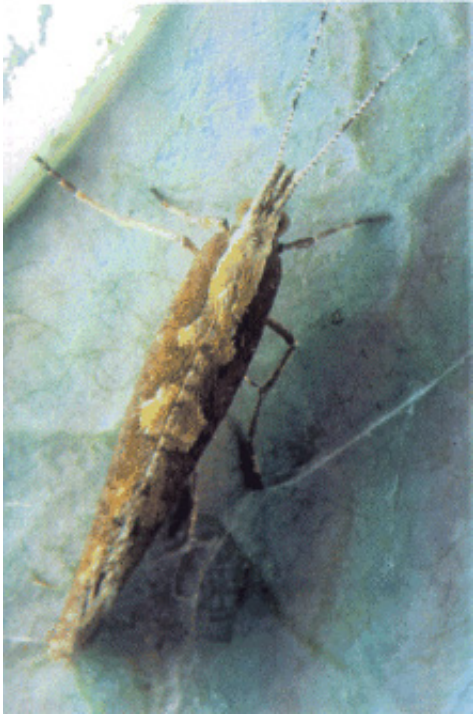
Figure 2. Female diamondback moth.

The adults are active at dusk and throughout the night. During the day, moths will fly from their resting places if plants are disturbed.