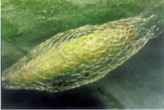
Figure 4. Diamondback moth pupa.

Management of diamondback moth requires an integrated approach.