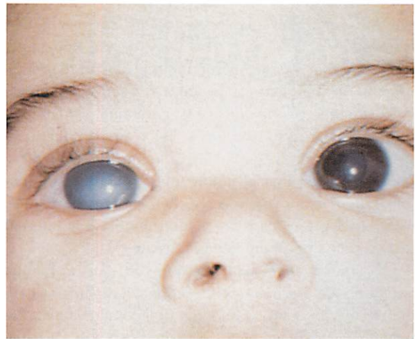
Photograph 2: Congenital glaucoma, right eye.

Viral conjunctivitis may begin unilaterally and progress to being bilateral. It is often associated with an upper respiratory tract infection. The conjunctiva is inflamed and there is usually some crusting of the lid margins. The discharge is watery and is a serous exudate combined with tears secreted as a result of the inflammation. Treatment is usually symptomatic. It is important to tell parents about lid hygiene and for crusts to be cleaned away. A child with prolonged or severe symptoms should be referred to an ophthalmologist. Viral conjunctivitis is highly contagious, particularly those caused by adenoviruses.