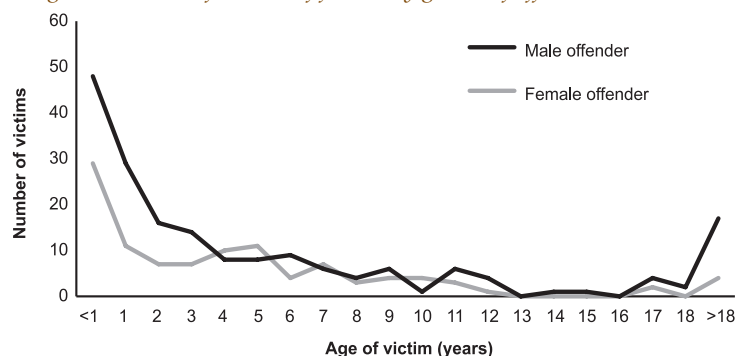
Figure 2: Age distribution of victims of filicide by gender of offender