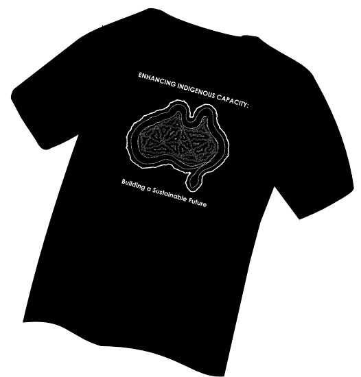
ABOVE: 2007 Symposium T-Shirt