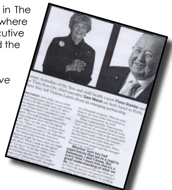
ABOVE: Double Take article