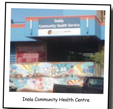
Inala Community Health Centre