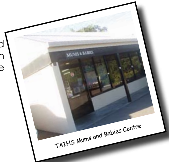
TAIHS Mums and Babies Centre