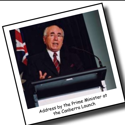
Address by the Prime Minister at the Canberra Launch