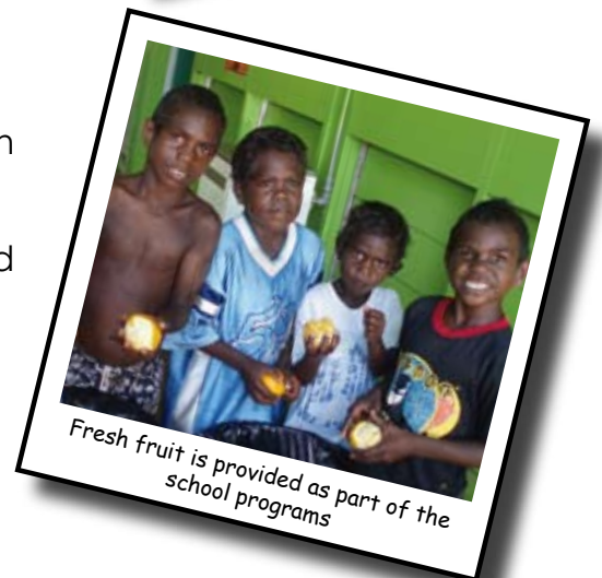
Fresh fruit is provided as part of the school programs