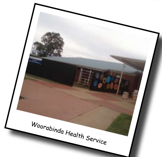
Woorabinda Health Service