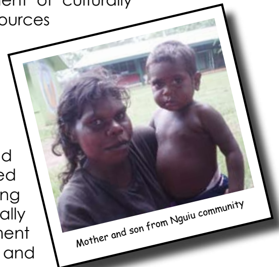
Mother and son from Nguiu community