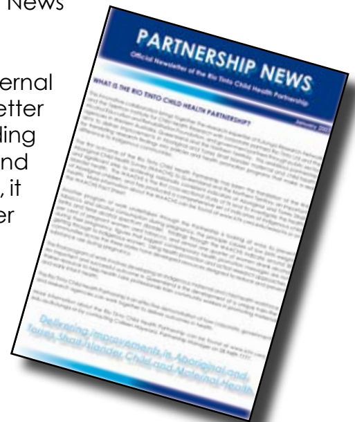
ABOVE: "Partnership News"

This provided the Partnership with a mechanism to communicate its work more broadly and publicly, including updates on each project and an overview of the national symposium to ensure the ongoing work of the Partnership was highlighted and promoted.