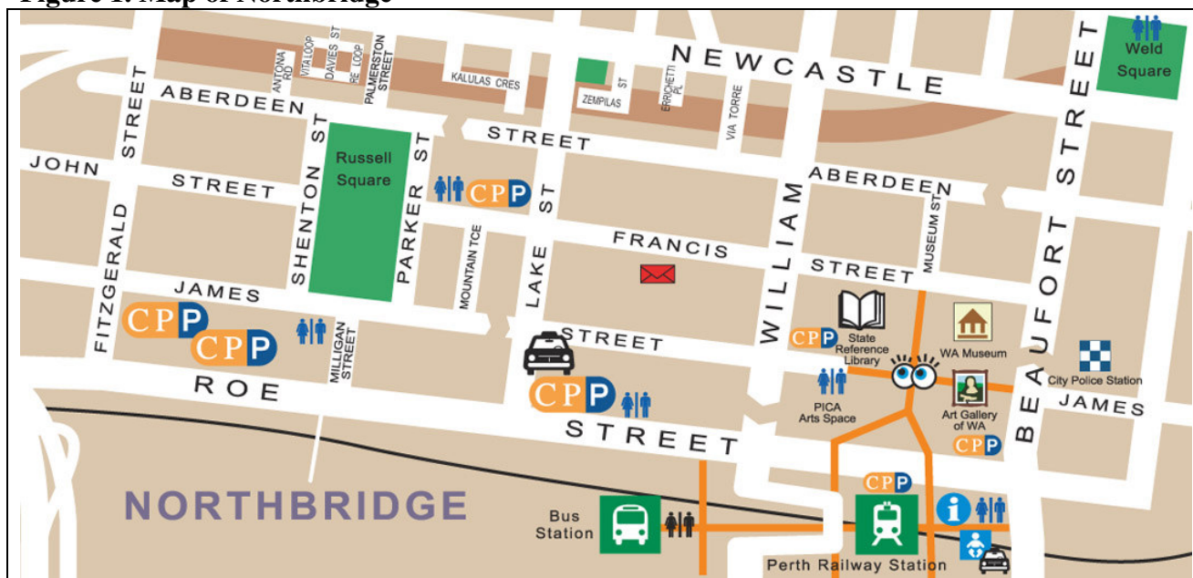
Figure 1. Map of Northbridge