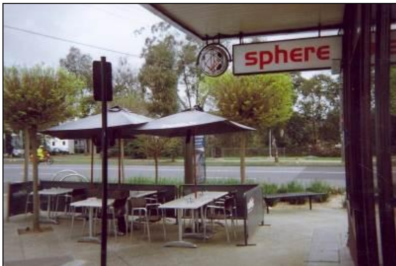
Figure 1: A local favourite

I sit here [café] and just have coffee. First coming here, it was really instrumental for me in restoring my ability to socialise with people. I'd meet people regularly who would come every time the same time and you build up this non-threatening little community and it's a relaxed atmosphere. You'll be sitting there and another regular comes along and you'll have a yarn and sometimes you can get into these really philosophical discussions.