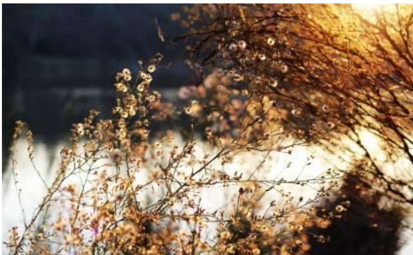
Figure 14: The botanical gardens

For Melissa, parks and gardens in and around her local neighbourhood reminded her of the force of nature, the fact that 'life just goes on'. She added that her favourite place (a local park) provided a range of affective resources to support her recovery.