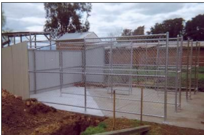
Figure 10: Off to work

The significance of these kinds of therapeutic affordances was illustrated in a rather novel way by Marie, whose favourite places included several local settings ideal for performing handstands. Marie regarded handstands as part of her recovery, likening the handstand to a contest or battle with one's fears and anxieties. She added that: