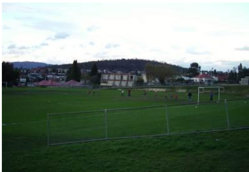
Figure 8: The local grounds

That one [photograph] is the club room of the soccer ground ... so if you ever feel like playing a bit of sport, a bit of soccer, you can join up and, yeah, and it's not really age limit, and it's just a great activity to do ... a bit of sport. Sport is good for your mental health as well, I find. You're out doing something, you're thinking clearly, and for fitness as well.