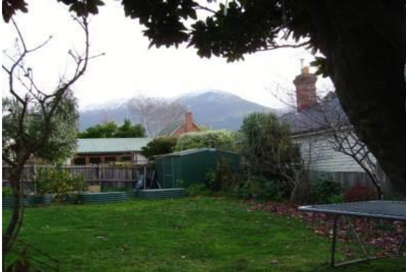
Figure 6: From the back steps

Yes, this is the place that I like to sit in the morning and have a cup of tea or have a little bit of toast, and enjoy the sunshine, when we get it, and look out over the mountains at the back of my deck. So it's actually quite nice, and it's nice at night time too, you can see the stars and the moon. To me I just like it, it makes me feel relaxed and [the house] is in a nice quiet sort of area as well, which makes me feel better in myself. But it just makes me feel good sitting outside. It's good for my mind as well, relaxing and having a yard and stuff.