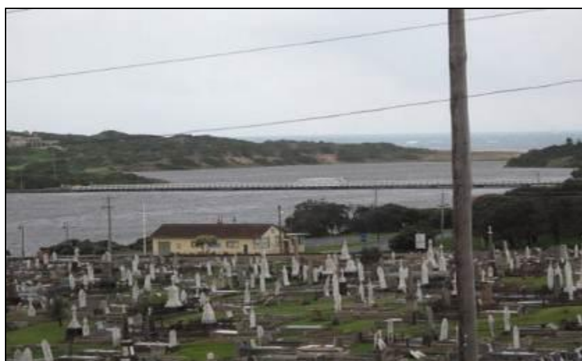
Figure 13: Out from the cemetery

I look at that cemetery and go, 'It's great to be alive'. I look at that river and go, 'the river is still flowing Jed, you're still here'. That river changes every day, that's a reflection back on myself, like there's always something different about life. If I keep serving myself, it helps me maintain my recovery.