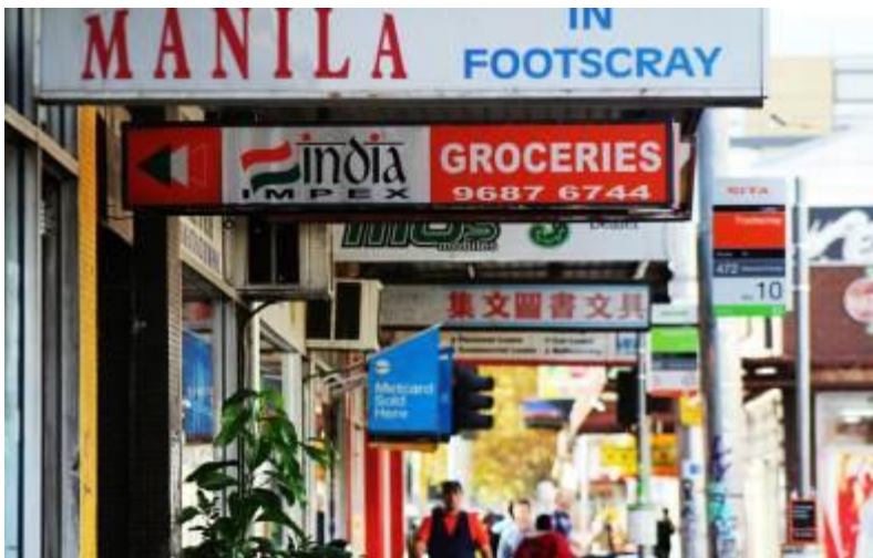
Figure 7: On the mall

I love that I have all these shops close by, the bus too. I am always discovering new things and it feels like the whole world is here, people from everywhere. I can grab a juice or buy a book from a second hand store, something for the house, sit in the mall and watch the world go by.