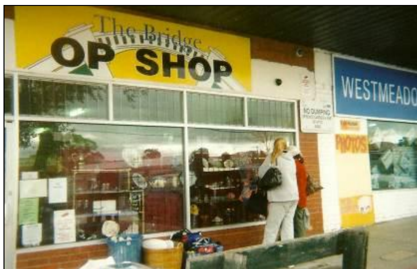
Figure 5: The Bridge Op shop

We have made repeated references to the significance of a local DVD store in Jack's account of his local community, noting in Chapter 4 a staff member's preparedness to give Jack unwanted movie posters. Jack added that: