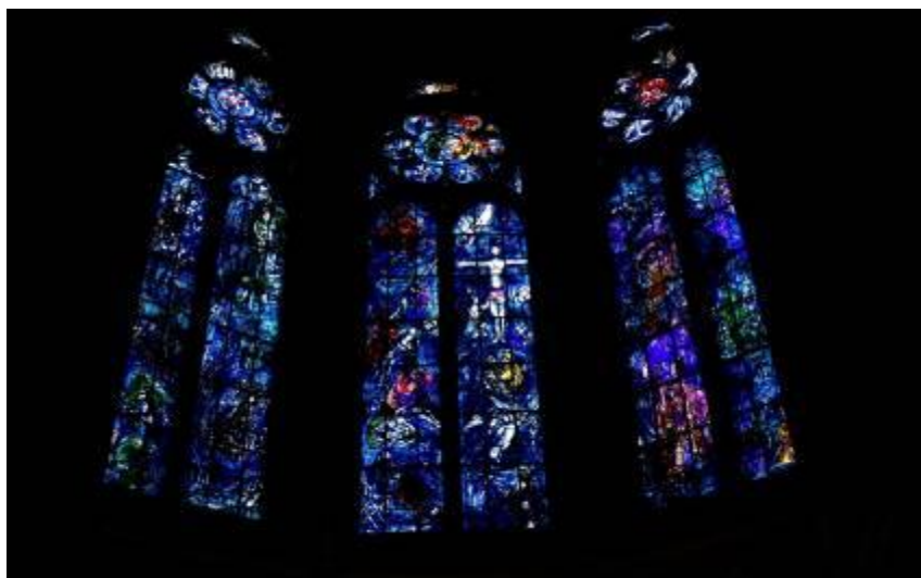
Figure 12: Where I go

Cara further emphasised the affective meaning of sacred spaces like her Church: