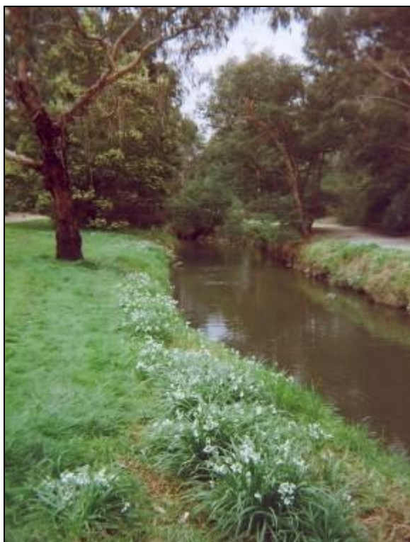
Figure 15: The local park

A number of participants suggested that natural spaces were particularly important in helping cope with 'bad days'. As Mark reported: