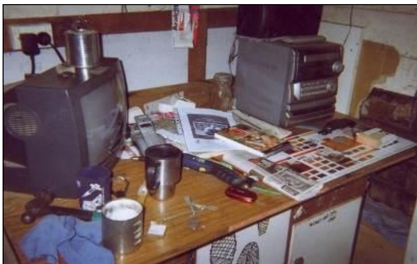
Figure 9: In the shed