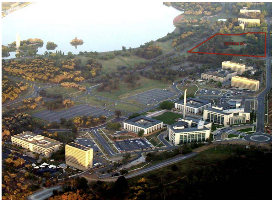
Figure 2: location of the new ASIO Central Office building (outlined in the top right corner) in relation to the Russell Security Precinct (the existing ASIO Central Office building is the lower and longer of the two buildings in the bottom left corner). 18