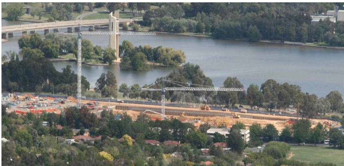
Figures 3 & 4: the new ASIO Central Office building takes shape. 69