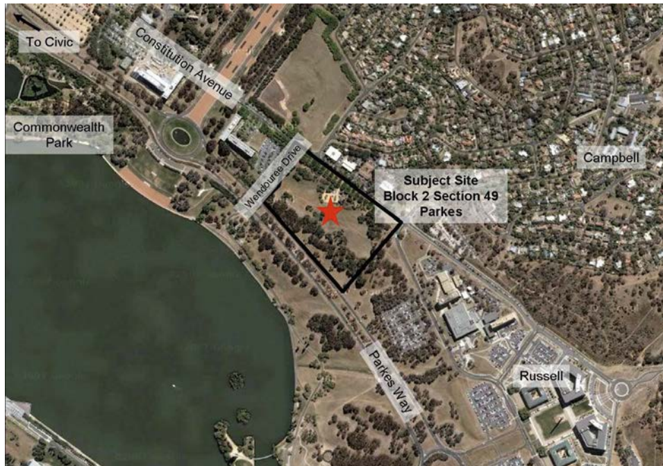
Figure 1: photo showing the location of the new ASIO Central Office building (indicated by the black outline), the Russell Security Precinct, and the nearby suburb of Campbell. 17