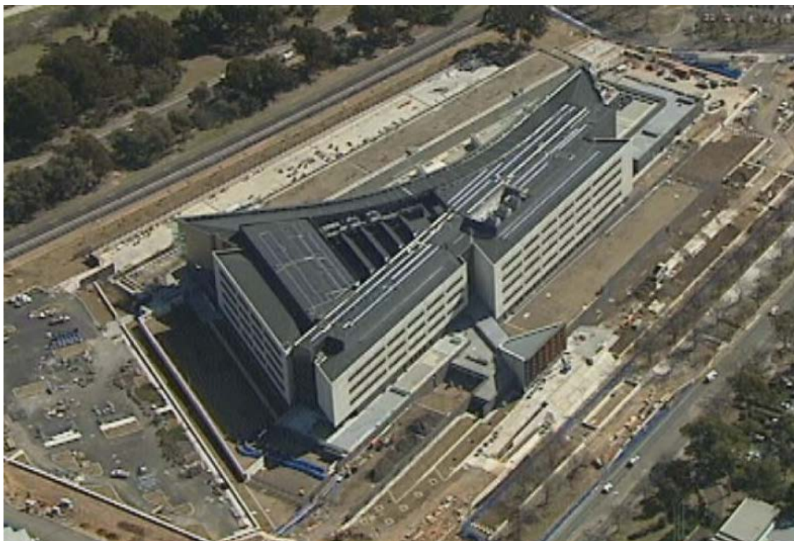
Figure 6: ASIO's new Central Office from the air. 120