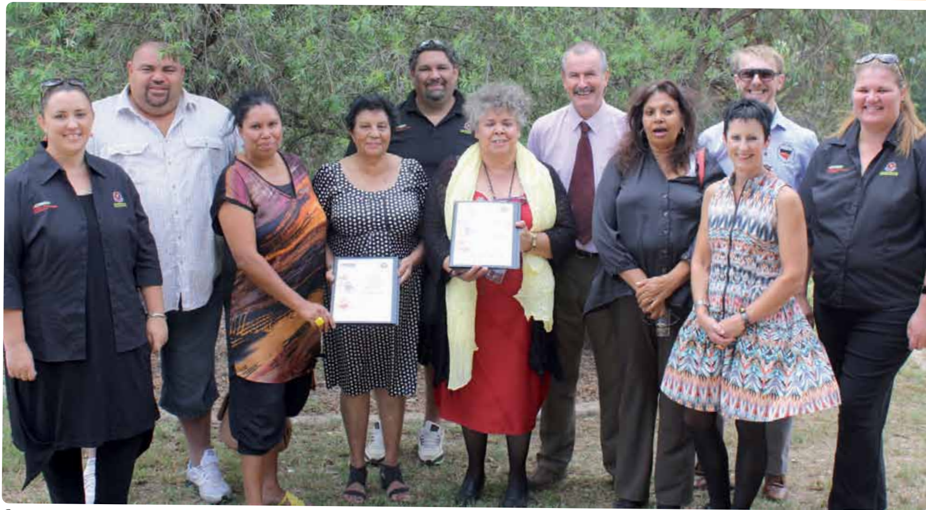
Representatives from UnitingCare CYPF, Board members from Ngurambang OOH Service and AbSec on the day of signing the partnership agreement.