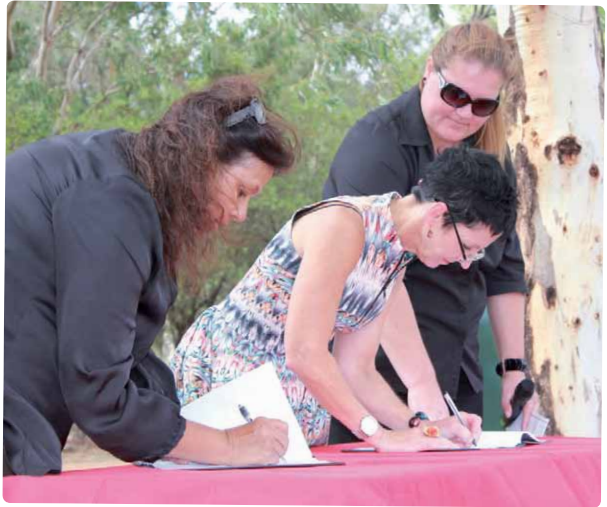
Signing the partnership agreement between Ngurambang OOHG service and Uniting Care CYPF.