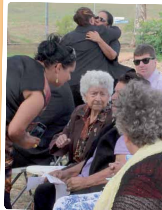
Community members from Dubbo, Wellington and Narromine were present to witness the signing of the partnership agreement between Ngurambang OOHC Service and Uniting Care CYPF.

For new ACCOs, like any fledgling organisation, establishment costs can be a major barrier to getting the service up and running and surviving early stages of operation. Funding for a partnership project manager within the auspice organisation provides critical support for an ongoing focus on partnership goals. However, partnership funding is predominantly linked to placements on a unit cost basis and there is limited further establishment funding built into the model. Resource and staff-sharing and co-location of services within the partnership can help to reduce start-up costs. There is, however, a significant risk to transitioning to independent service operation where ACCOs lack necessary capital resources, and non-Indigenous agencies lack dedicated-resources for supporting their ongoing development.