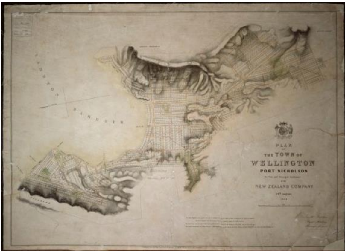
Figure 2: Lithographic map entitled “Plan of the Town of Wellington, Port Nicholson, the First and Principal Settlement of the New Zealand Company”.