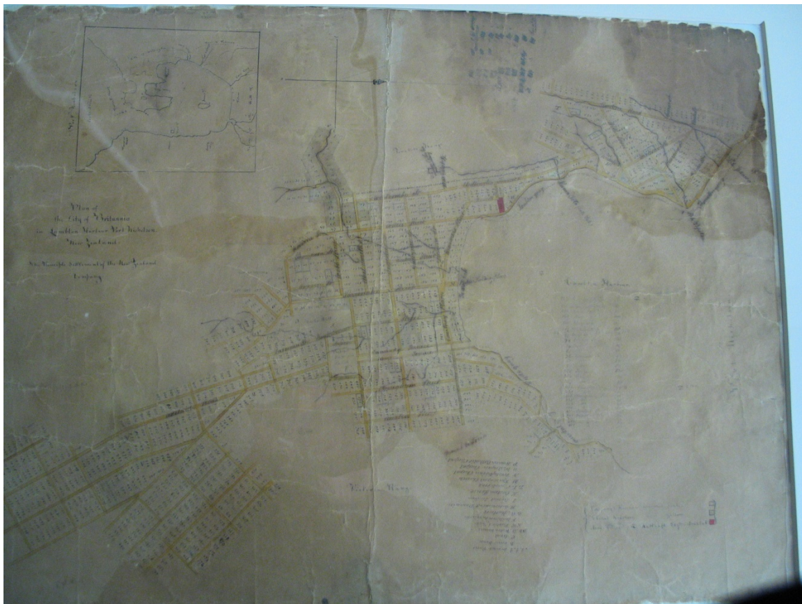
Figure 1: Plan of the City of Britannia in Lambton Harbour, Port Nicholson, New Zealand, the Principal Settlement of the New Zealand Company (Image courtesy of Museum of New Zealand, Te Papa Tongarewa, Wellington. CA000433/001/0001).

At the present time only one item has come to light locally that may qualify for the status of an official manuscript map. It has rarely been viewed outside of the confines of archival storage although it was digitised in the late 2000s. 7 According to curatorial and archives staff at the Museum of New Zealand Te Papa Tongarewa it appears to have come into the Dominion Museum in 1933 as part of the Horace Fildes Collection and it was kept in the Museum’s History Collection for several decades (Fitzgerald pers. comm., Twist pers. comm. 2005) The item in question is the “Plan of the city of Britannia in Lambton Harbour, Port Nicholson, New Zealand, the Principal Settlement of the New Zealand Company” (See Figure 1: Plan of the City of Britannia in Lambton Harbour, Port Nicholson, New Zealand, the Principal Settlement of the New Zealand Company).