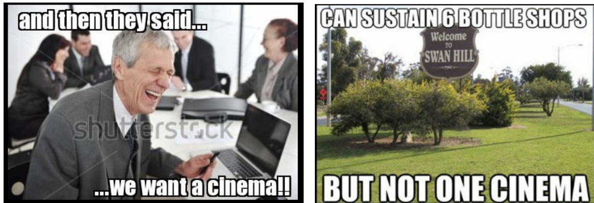
Figures 2 and 3: Images from the Facebook page Swan Hill Memes , 2012.

The dichotomy of the cinema as a meeting place for Swan Hill youth is an ongoing issue (the lack of a cinema, according to one commentator on “Swan Hill Memes” (figures 2 & 3), renders it a “fukn sad pathetic s***hole”). The complaint is recognized by the city’s burghers who also believe that the central issue is not so much the presence or absence of a cinema per se but the role a cinema could play as a place for young people to meet new people away from parental supervision or the eyes of other Swan Hill locals. Of course, there is genuinely little expectation of meeting “new people” in a town where almost all people are familiar; the attraction, therefore, of Bendigo and Melbourne is apparent. It should also be noted that the blaming of the city council for the demolition of the cinema is barely justified (the sale of the land was a commercial decision between private parties); the Swan Hill town hall can be used as a cinema, and periodically serves as one, although it is not part of a cinema circuit. In late 2013, Twilight Cinemas announced its intention to open a three-screen “boutique” cinema in an existing retail building in central Swan Hill (Anon 2013; Burnside 2013).