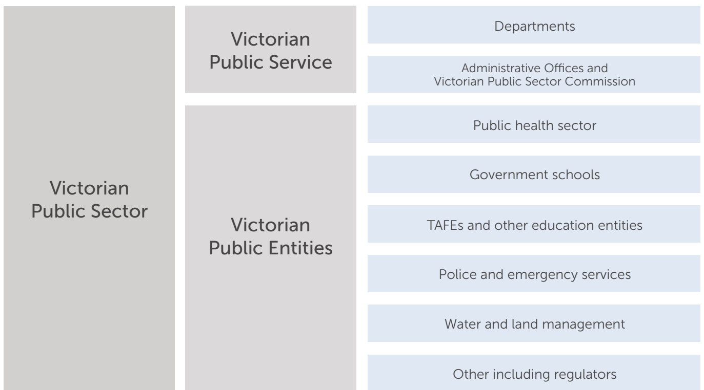
Figure 1. Composition of the Victorian public sector

The Victorian public sector is comprised of both the Victorian Public Service and a range of Victorian public entities (Figure 1).