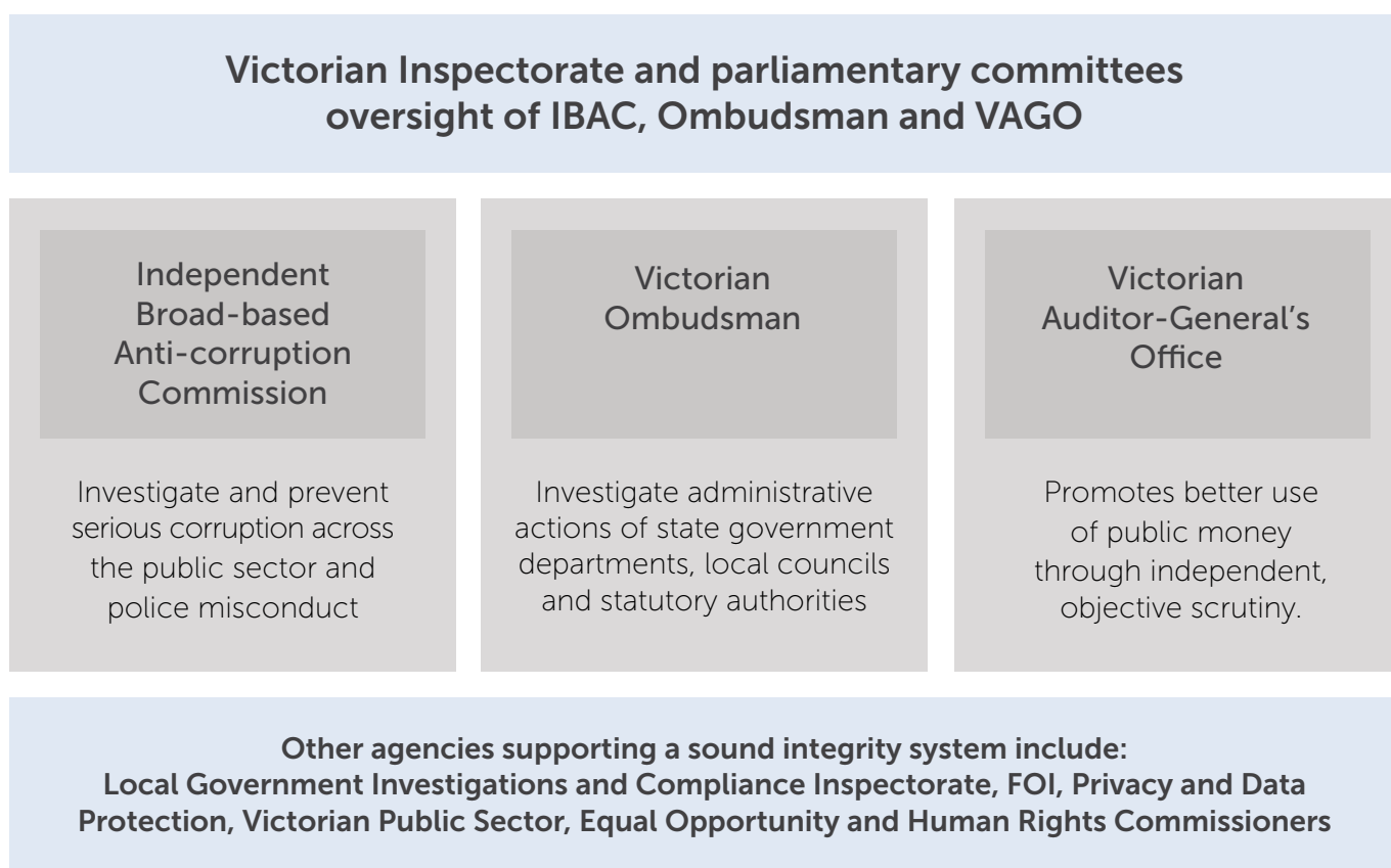
Figure 2. Victoria's integrity system

This section provides a guide to the key functions and responsibilities of each.