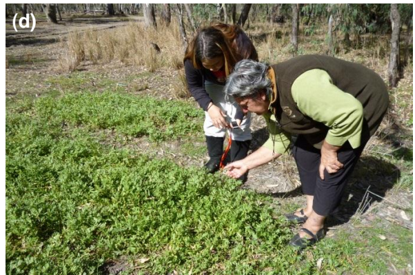
Figure 2: Cultural data collection: (a) equipment, (b) training, (c) & (d) interviews.