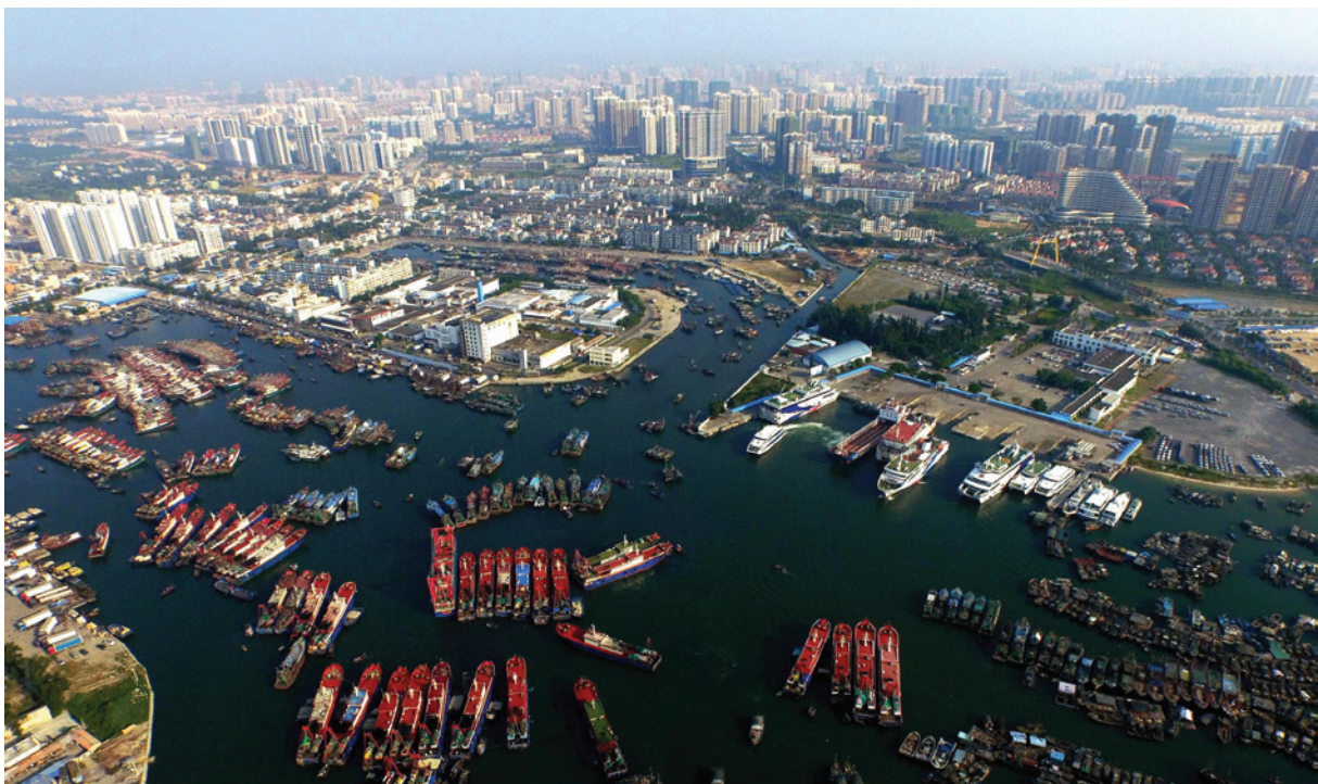
The port in Beihai in southwest China, starting point of the country's ancient marine silk road and one of the main export channels of the 21st-Century Maritime Silk Road

Second, the enthusiasm for the Belt and Road is at odds with the growing risk aversion plaguing Chinese institutions, be it for fear of corruption probes or due to the economic slowdown and greater scrutiny on expenditures. After almost two decades of overseas investments, Chinese companies and officials are facing intense pressure to show that their ventures in far flung corners of the world have reaped benefits, but many of them are finding it hard to do so: In 2013, for instance, the Vice President of China's Mining Association estimated that 80% of Chinese overseas