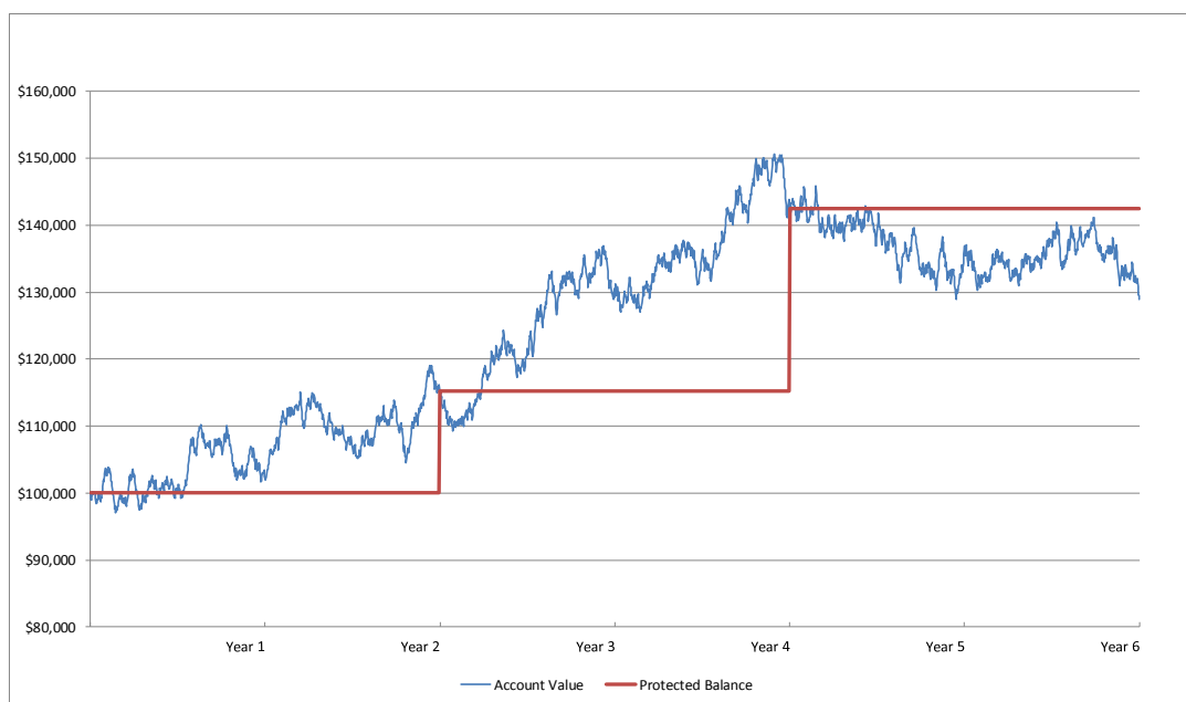
FIGURE 1: Protected Investment

The blue line indicates a simulation of the account value, while the red line illustrates the protected balance with the lock-in growth at years 2 and 4. Note that the account value fluctuates with investment performance. In this example, the initial contribution is $100,000 and the selected term is 6 years. For this simulation, the policyholder will receive $142,425 at the end of 6 years, even though the account value is only $129,000. Of course, this favourable outcome is presented merely to illustrate how the product works—it is entirely possible that the relevant embedded option could finish out of the money.