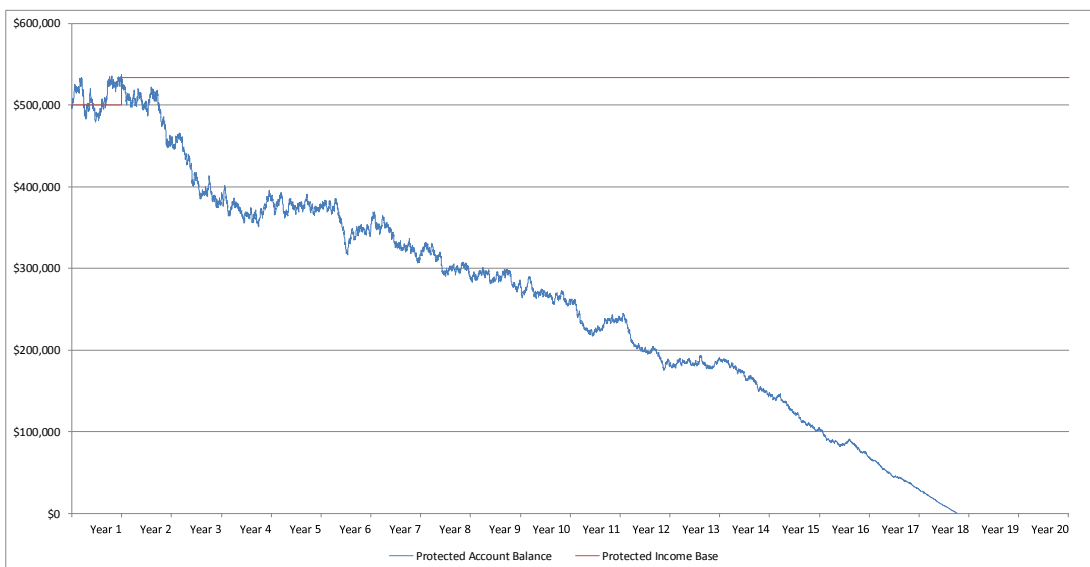
FIGURE 4: Protected Income

Figure 4 illustrates the main features of the Protected Income product.