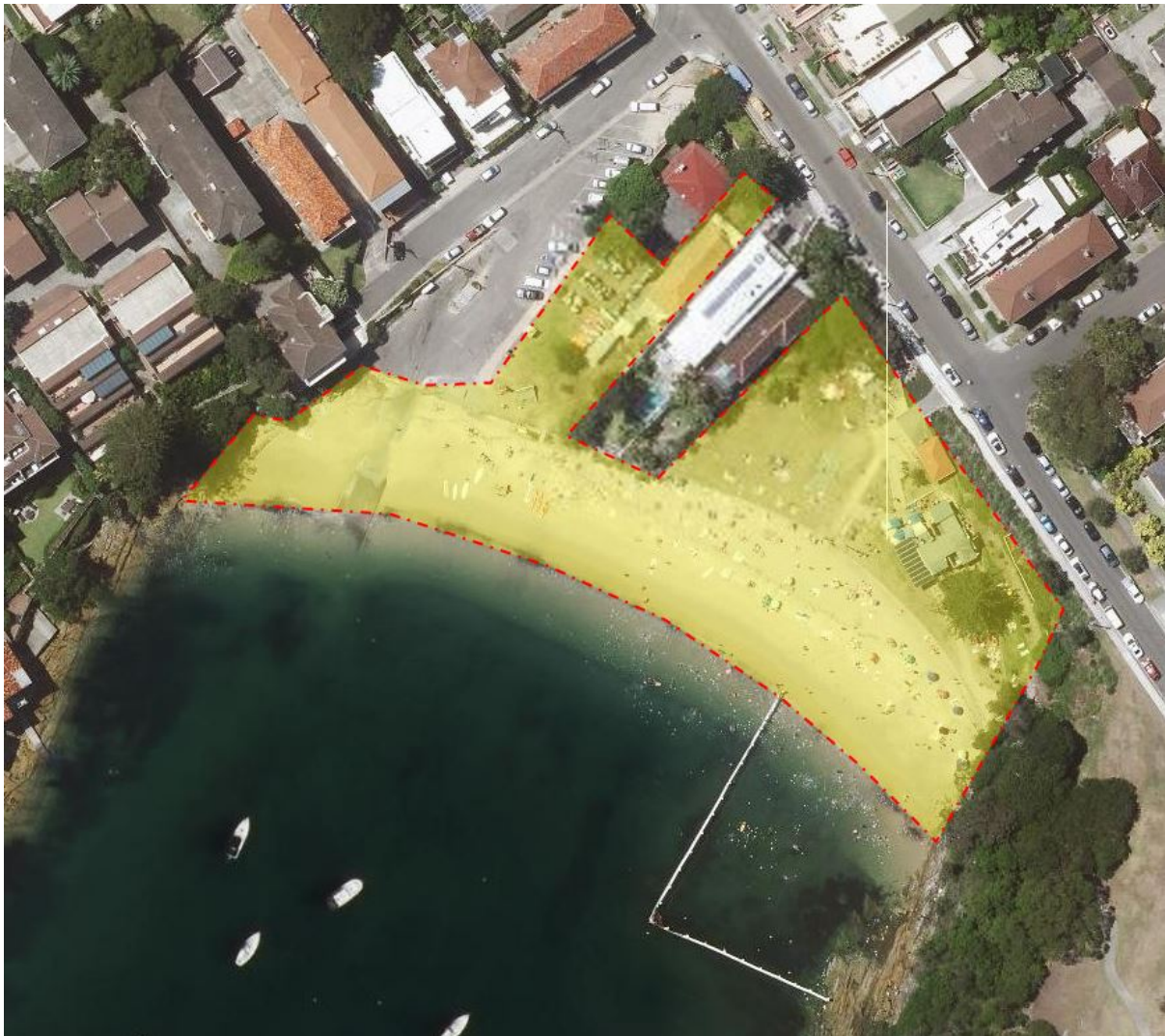
Little Manly Beach. Imagery date : 1/1/2014

From the above spatial type analysis we could presume that each topographical feature enables, different intensities of use, for different social activities. A survey of Little Manly Beach, Finger and Point taken at 3pm on January the 1st 2016 bears this out. Videos and Photos were taken at this point in time, and activity and numbers counted from this documentation. January the 1st 2016 was 26C with clear skies. The date was chosen because it is an annual summer holiday with a set date, but not a day of great celebrations, it is also a day that appears busier than a summer work day but not as busy as a summer weekend.. While Manly Point west of Little Manly Point has greater views of the Heads and Spring Cove, it was not surveyed as they have been sterilized of public activity by private ownership.