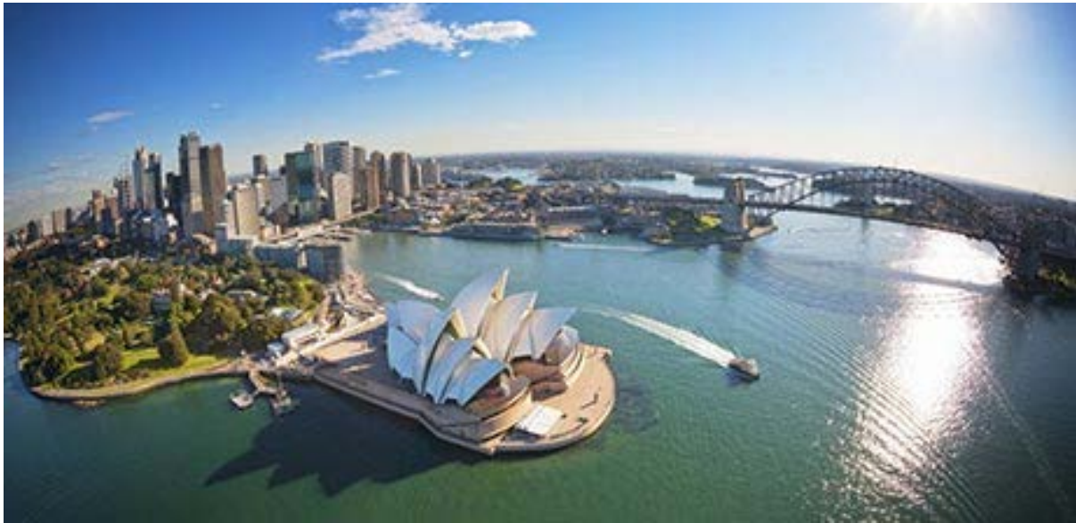
Sydney Cove.

The Opera house and Harbour Bridge are the gatekeepers to the city, unbuildable without the harbour points from which they spring, an iconic power derived from Sydney Harbour great civic plaza. A harbour that can both promote and reveal while simultaneously segregating and concealing. The Cove is the harbours defining typology. Coves with Bays that generate community and internal identity and Points that projects the City's public face internationally and provides a forum for civic engagement. No other Australian city is as fundamentally defined by its topography as Sydney.