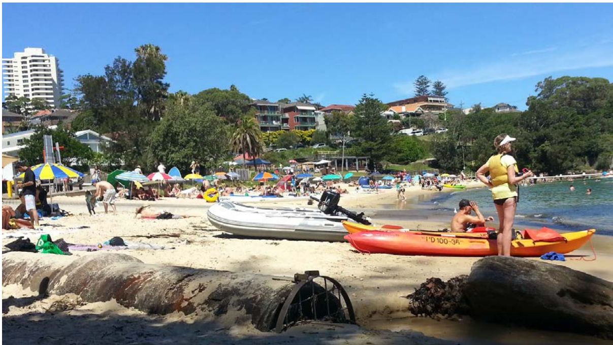
Little Manly Beach.. Imagery date : 1/1/2016.

So why does the bay beach work so well as a public space, are bays the ideal environment for the creation of neighbourhood and community? Bay (Beach) as community maker. The bay is close to an 'ideal' neighbourhood space. The special physical qualities of bays invite people to linger, play and interact - requirements for creating community space. On top of that residents are likely to engage in physical activity in a very informal way, adding egalitarian and health aspects to that communal space (as well as certain amount of hedonism).