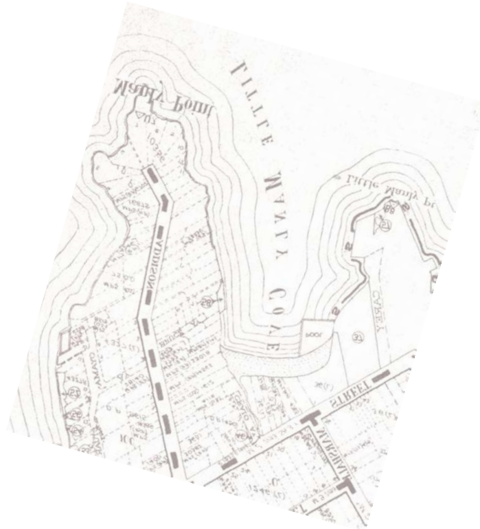
Map of the Village of Manly, County of Cumberland, New South Wales, July 1908. Metropolitan Land District NSW.