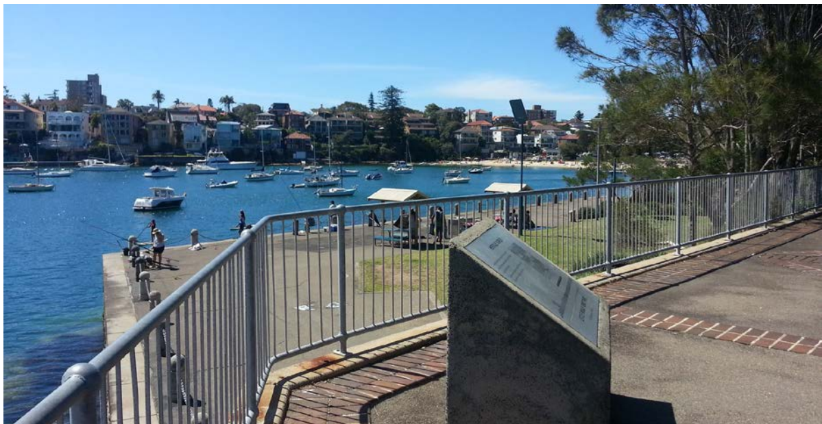
Little Manly Point. Imagery date : 1/1/2016.

The Point is a complementary feature to the bay. While the bay’s prominence is in its relationship to the surrounding land, the Point’s prominence is in its relationship to the surrounding water. The Point plays on the larger stage of the harbour. Points are at once exposed but isolated, and it is from those characteristics that its roles within Sydney harbour is defined. What are the elements of the Point that lend itself to creating great city spaces.