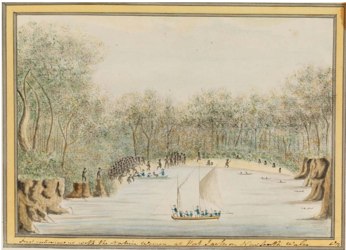
First interview with the Native Women at Port Jackson New South Wales, February 1788 by William Bradley, 1789. Watercolour, 230 x 165mm