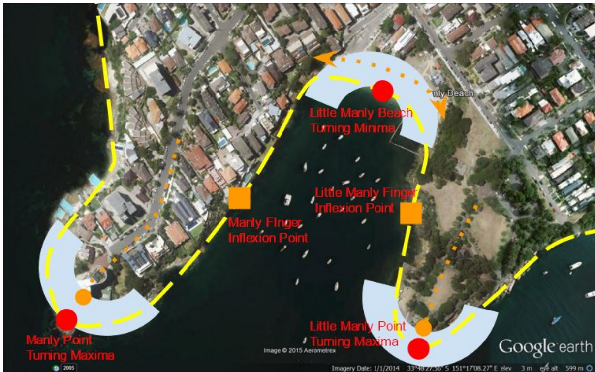
Little Manly Cove Diagram. Imagery date : 1/1/2014

The topographical features of the Cove: Point, Finger and Bay are defined by their shoreline edge, the relationship between water and land. These topographical features can be re-ducted back to their topographical elements. Elements of the harbour edge that have different quantifiable values depending on the feature. The topographical elements investigated here are: Elevation of the shoreline, Slope into the water, Plan shape of the topography, Morphological form of the topography and the Material at the harbour's edge. The points investigated above are calculus derived and were surveyed by the author.