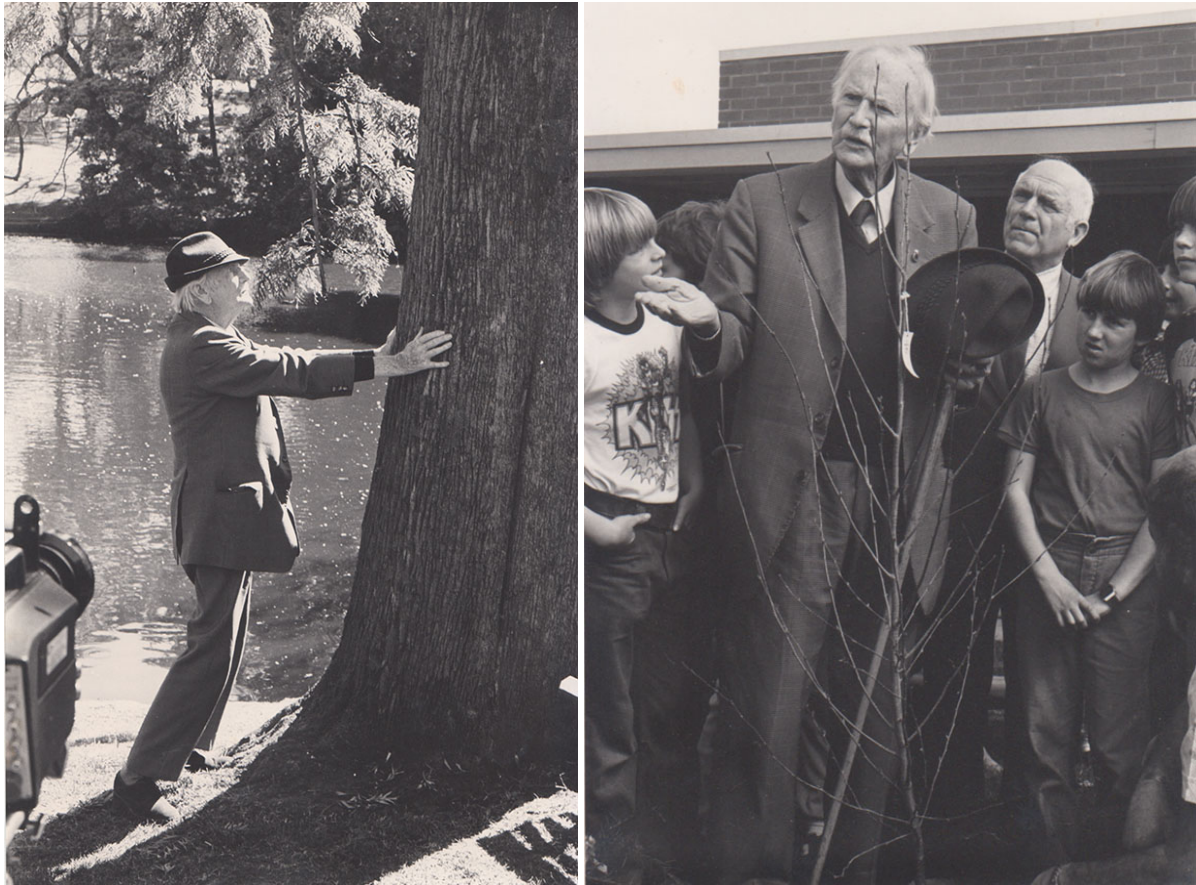
Figure 6: [left] Richard St. Barbe Baker in Melbourne at the Royal Botanic Gardens, 1981 (Photograph: R Neale. Source: A Neale); [right] St Barbe Baker speaking to primary school children in Thomastown, Victoria, with A Rein, President of Men of the Trees [Victoria] in background, 1981 (Photograph: R Neale. Source: A Neale).