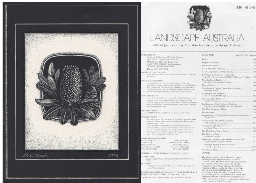
Figure 2: [left] The original 1978 scratch-board logo or colophon by Ralph Neale, depicting a study of Banksia integrifolia (author's collection); [right] the colophon as typically used within the journal opening pages of each edition of the journal ( Landscape Australia . 1982, 167.)