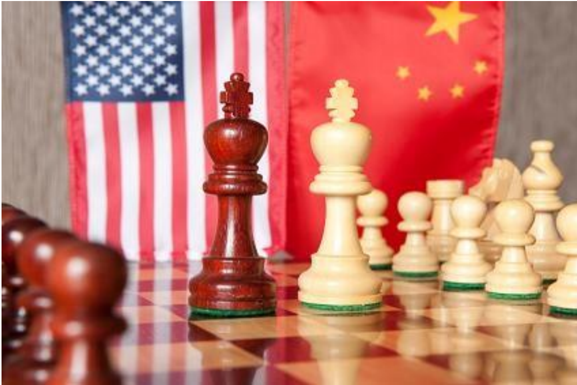
Figure 2. A battle for the title of world economic superpower.

to state its discontent with the policy and has urged many of its allies to refrain from supporting the AIIB and signing on to the OBOR. Professor John Mearsheimer in a CCT interview predicted that China's increased presence in the Indian Ocean would induce conflict between China and the US. He was quoted stating that in this instance China will most likely be met by the US and Indian Navy , creating fear amongst many that this policy will increase the tension amongst some major states.