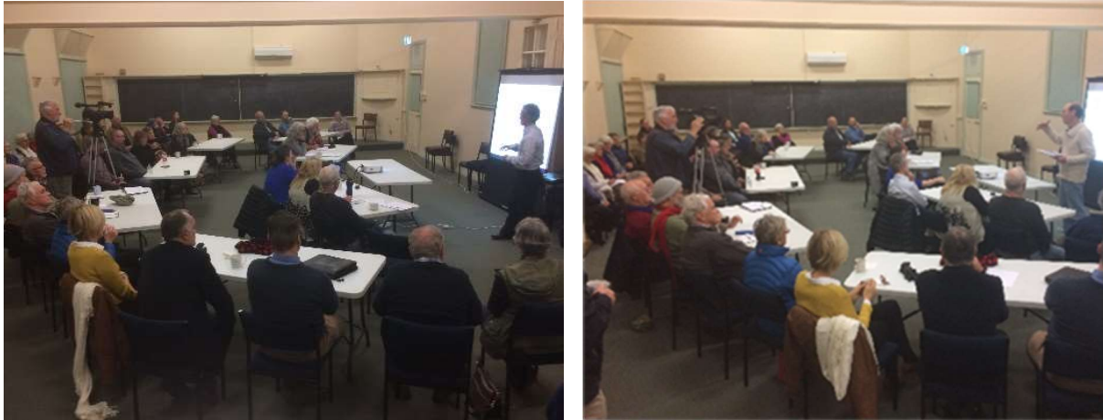
Photo: over 40 people attended the Community Energy Information Session in Bairnsdale in July 2017 (above).