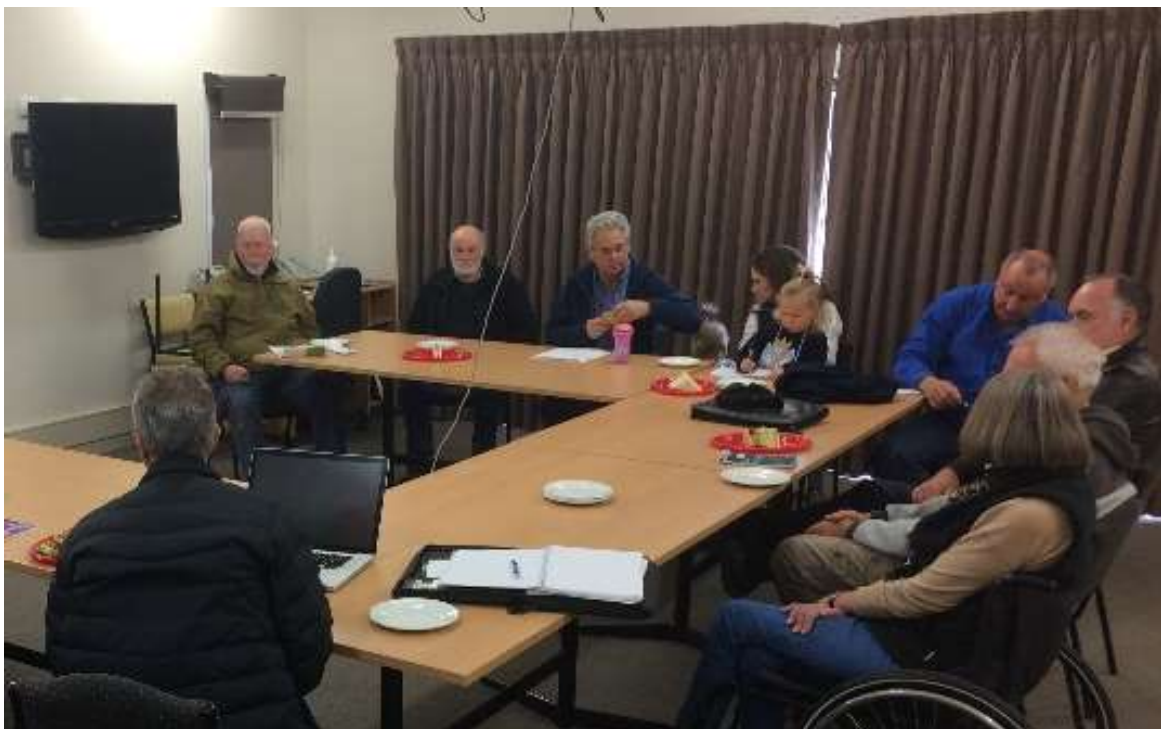
Photo: Engagement at Omeo took place to cover issues such as end of grid and renewable technology options.