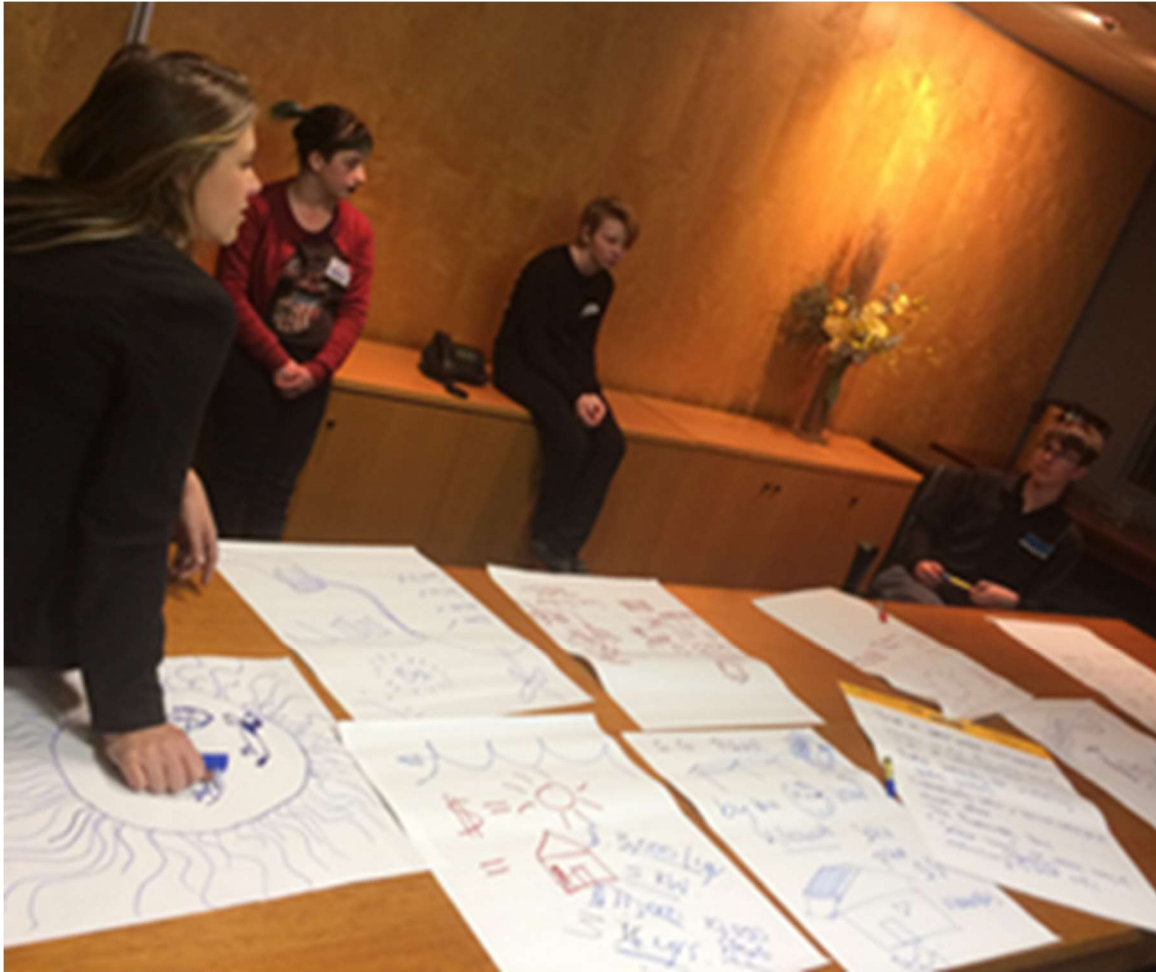
Photo: Bright Futures brainstorming sessions with the Youth Ambassadors.