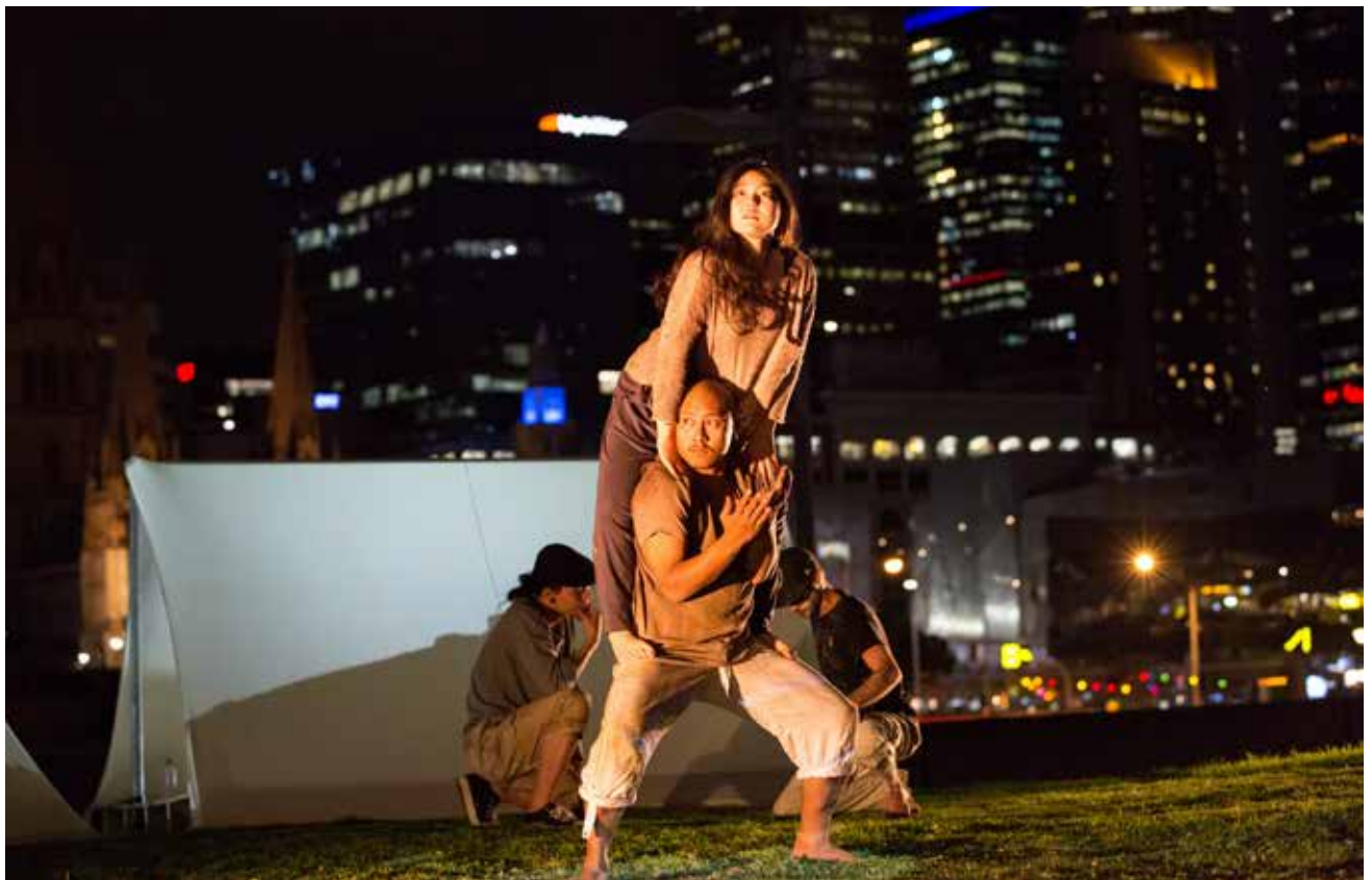
Inner Beat Live, Asia TOPA.

Engagement with the arts of one's background helps to keep diverse cultures and identities strong, whether in First Nations, Anglo-Celtic, or diasporic a communities. All Australians benefit from this rich cultural tapestry.