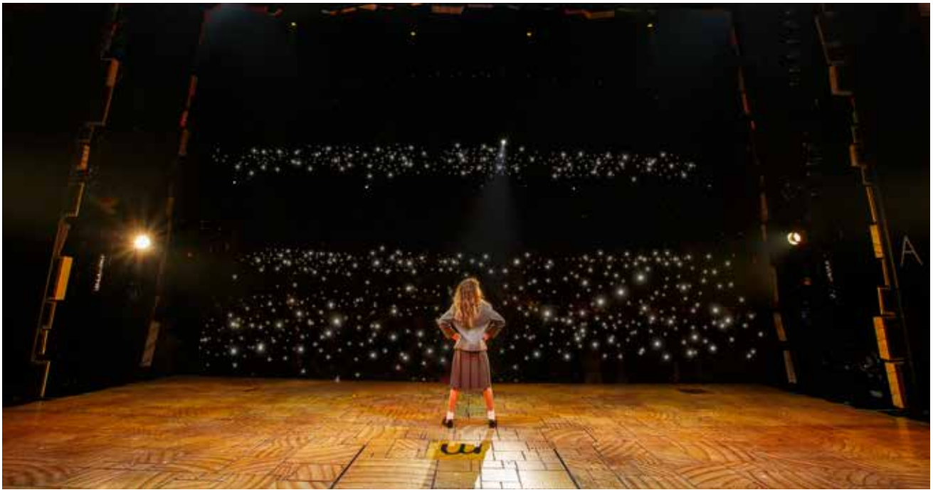
Matilda the Musical Australian Production, view of audience from the stage.

Matilda the Musical , the adaptation of Roald Dahl's book with music and lyrics by Tim Minchin, has been touring Australia since July 2015. Prior to that it was a hit on Broadway and in the West End, winning seven Olivier Awards and five Tony Awards.