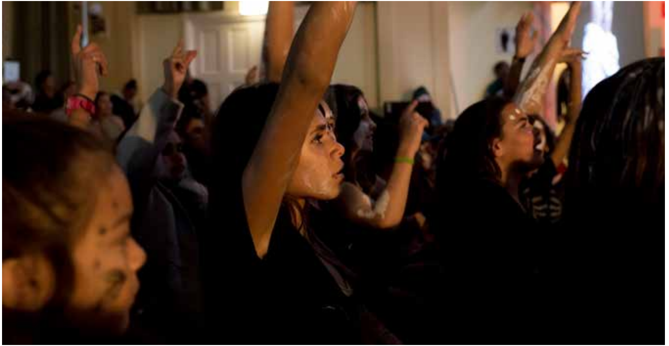
Festival of the Brolga 2016, Beyond Empathy.