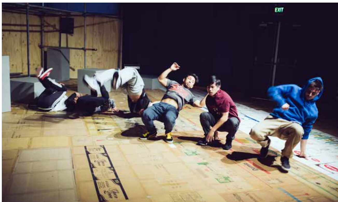
Jump First: Ask Later, PYT | Fairfield.