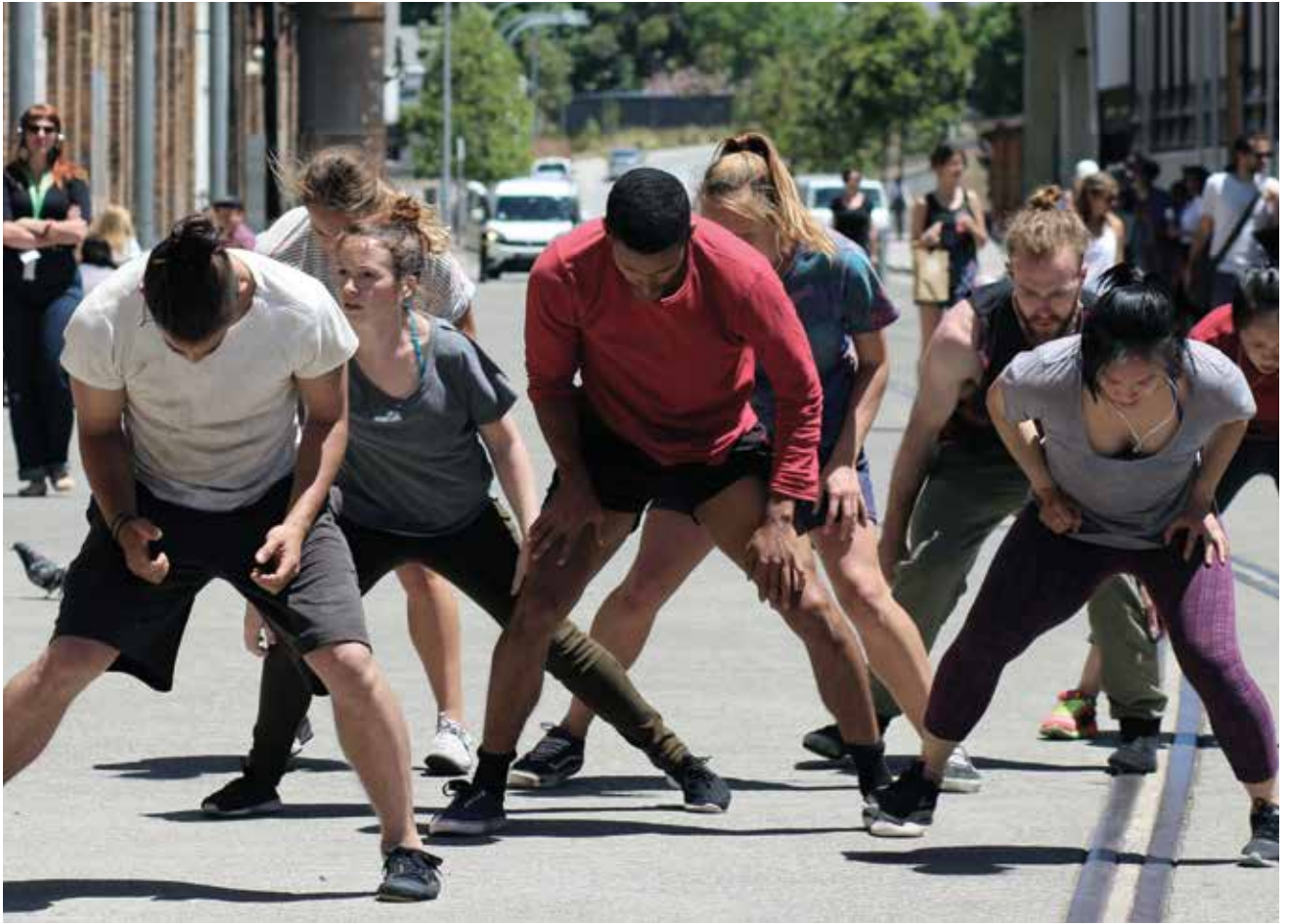
The Stance , choreographed by Liesel Zink, Performance Spaces Liveworks Festival , 2016.

The Stance enlivens busy public spaces with joy and curiosity as thousands of pedestrians unexpectedly witness, and become a part of, an evocative live performance.