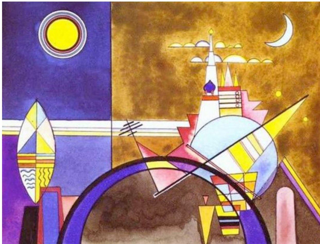
Wassily Kandinsky, The Great Gate of Kiev, 1928