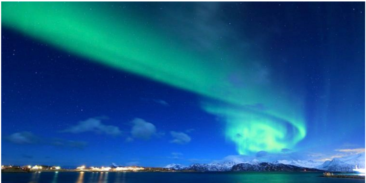
Northern lights, Norway