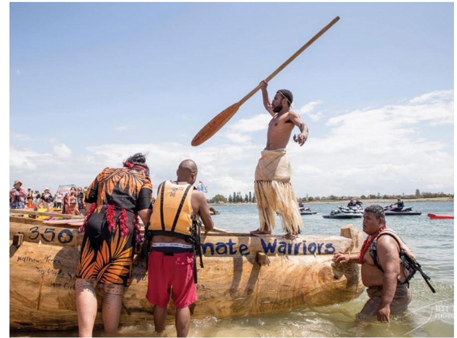
Figure 3: Image by Jeff Tan and courtesy of 350 Pacific.

in some countries such as Samoa, Tonga and Fiji have become a critical dimension of cultural identities in the 21 st century.