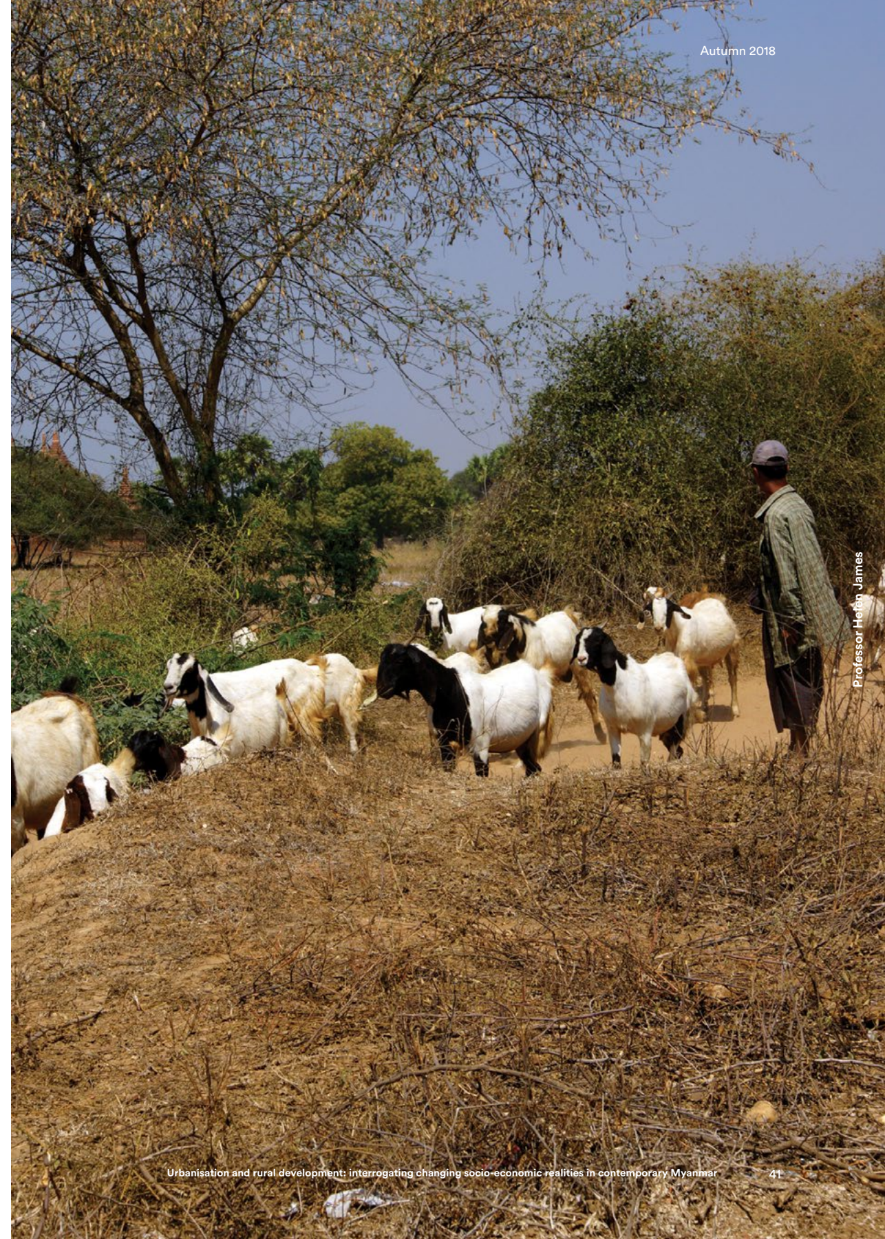
Professor Helen James

But there are many emerging downsides to this narrative of apparent increased prosperity arising from rural-urban migration. In the villages of the Delta, rising sea levels are resulting in soil salination which cannot sustain the crops of rice and legumes that provide the staple income for small farmers. Their plants grow, then wither and die leaving the farmers without a crop for food or income. Increasing poverty means that they must seek alternate sources of income such as fishing, making thatch from nipa palm, and weaving. Families separate as the young adults leave for the construction jobs in Yangon. Those family members remaining behind continuously seek alternate income generation opportunities. The movement of young adults, both male and female away from such rural communities is resulting in depletion of workforce capacity to support the productivity of agricultural communities. As the local workforce decreases, day wages for casual labor increase; this,