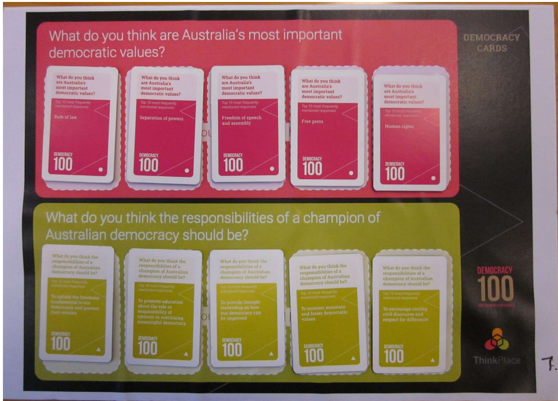
Table 8: Democracy Board