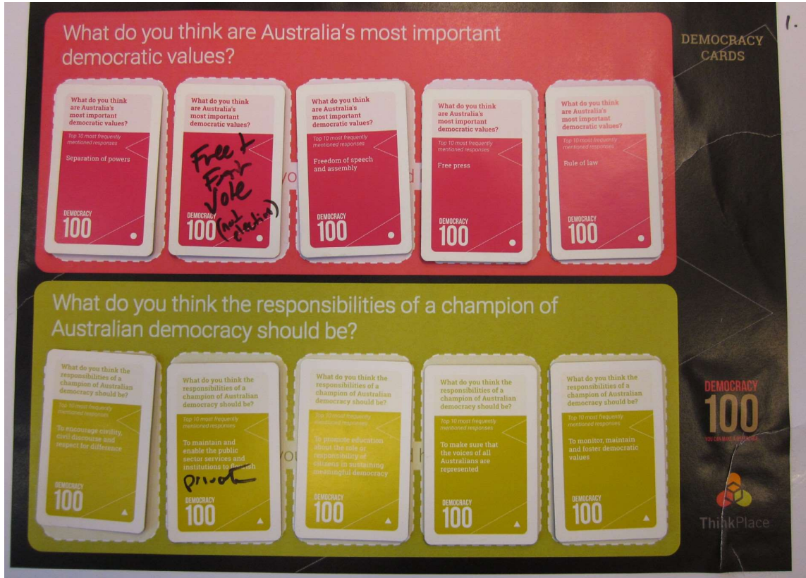
Table 2: Democracy Board