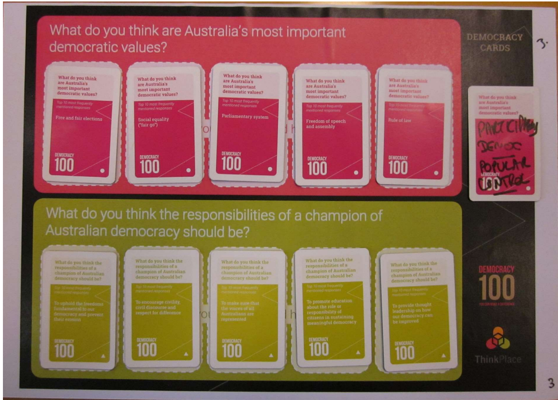
Table 4: Democracy Board