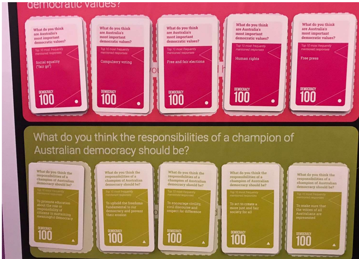
Table 12: Democracy Board