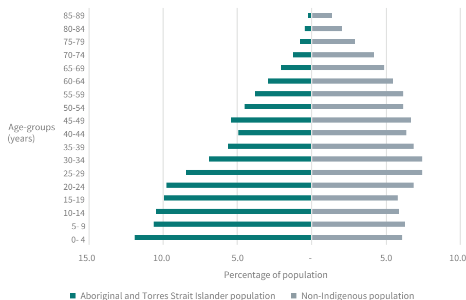
Figure 1. Population pyramid of Aboriginal and Torres Strait Islander and non-Indigenous populations, 30 June 2018

Note: Excludes 90 years and older age-group.