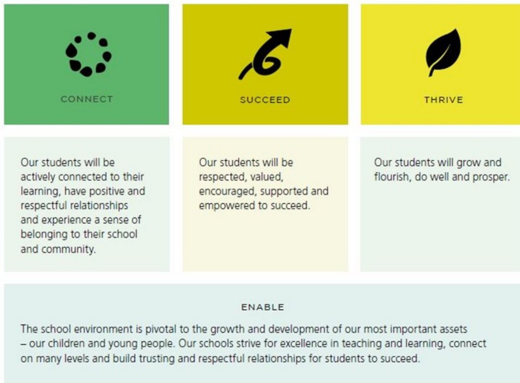
Exhibit 2: The Wellbeing Framework for schools