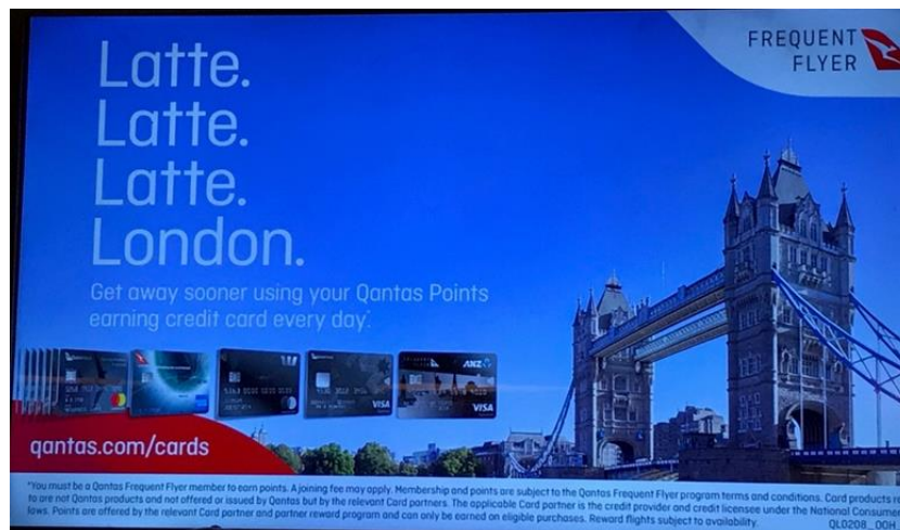
Figure 2: Qantas promotional material

An exploration of loyalty scheme advertising campaigns indicates that some advertising appears to make broad statements that no reasonable consumer would likely interpret literally. For instance, one recent campaign by Qantas for credit cards promoted buying cups of coffee as a pathway to an international flight (using the promotional line 'Latte, Latte, Latte, London'). Taken literally (which may not be the intention), the member would need to purchase 20,000 to 40,000 cups of coffee with a Qantas-branded credit card to earn enough points. Assuming the ordinary person buys 1-2 cups per day, this may take up to 55 years. It is unlikely this would be taken literally by a consumer.