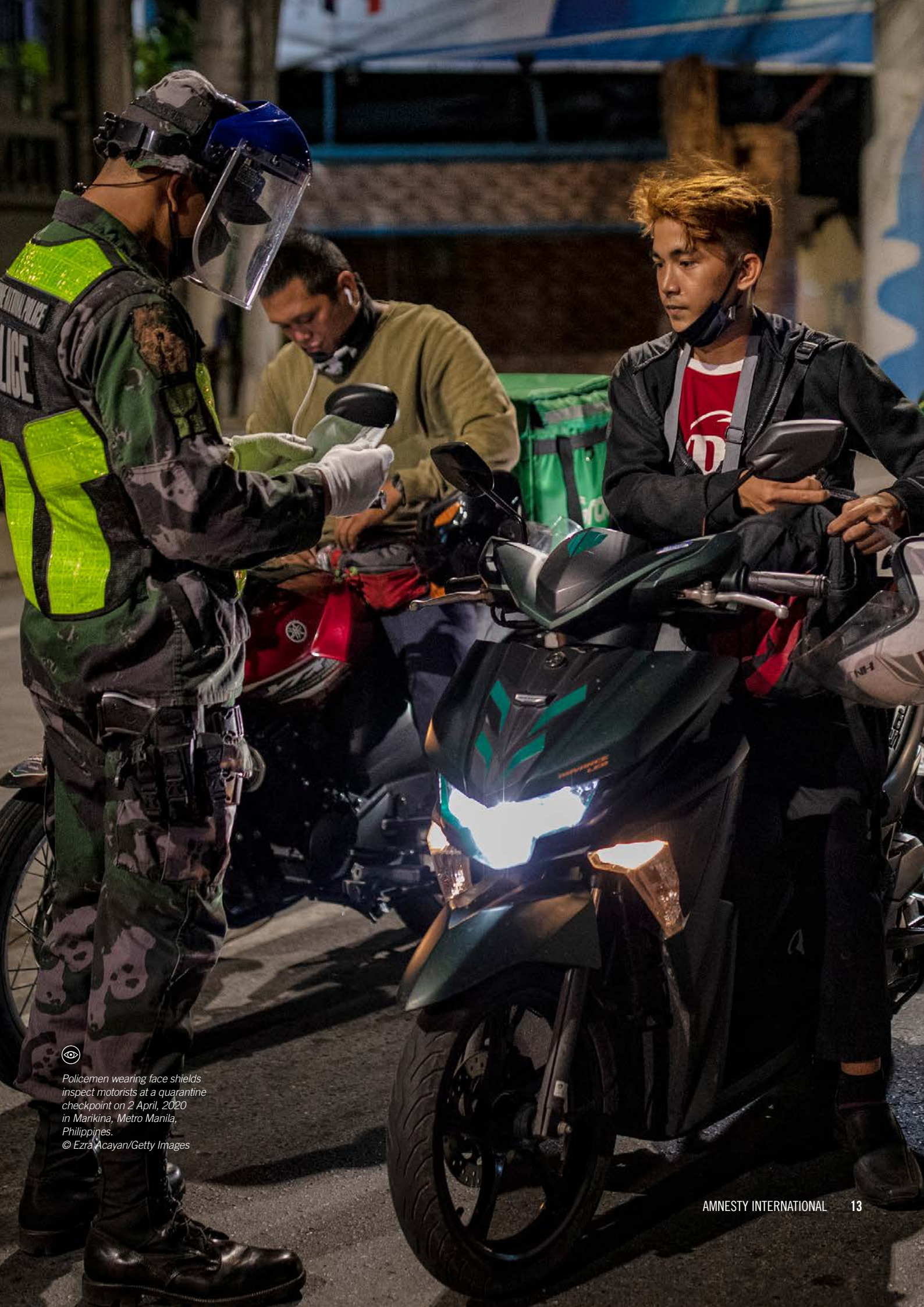
© Policemen wearing face shields inspect motorists at a quarantine checkpoint on 2 April, 2020 in Marikina, Metro Manila, Philippines. © Ezra Acayan/Getty Images