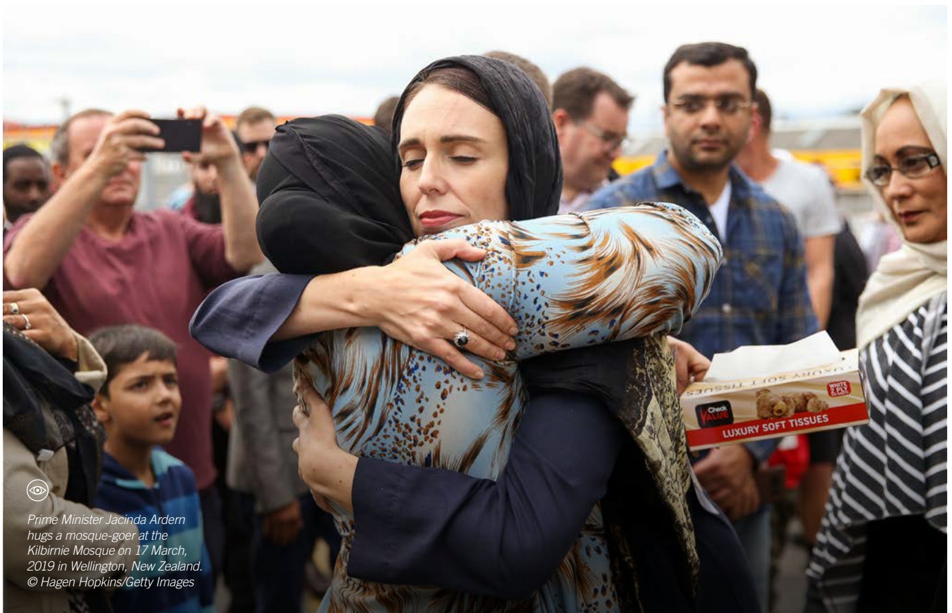
Prime Minister Jacinda Ardern hugs a mosque-goer at the Kilbirnie Mosque on 17 March, 2019 in Wellington, New Zealand.

The Scottish government expressly interweaves Scottish nationalism and a multiculturalism and is one of the few governments in Europe that would run a campaign like "One Scotland, many