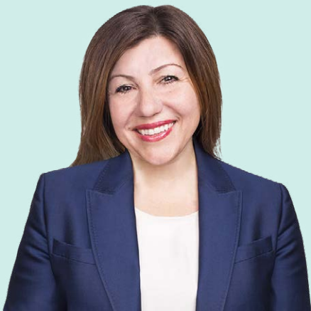
The Hon Sophie Cotsis MP Minister for Industrial Relations Minister for Work Health and Safety