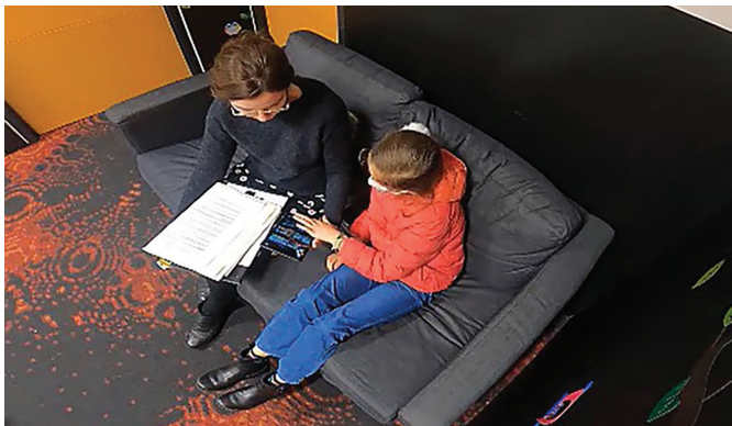
Figure Three: 8-year-old girl demonstrating how she finds classifications on Netflix and ABC iview.

Children’s low cultural literacy with content was contrasted with their high “technical fluency” – their capacity to understand and fluidly navigate platform interfaces, catalogue designs, recommender systems, and classification display systems. For instance, in the “show-and-tell” observation sessions, children were able to display to the researcher how to find the ratings (G and PG) for shows across different platforms, such as Netflix and ABC iview, as in the below example.