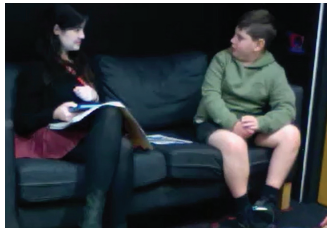
Figure Two: 8-year old boy recoils in surprise when learning his two favourite shows, Little Lunch and InBESTigators , are Australian, not American.

These findings shed further light on prior industry research with parents that found that children do not care about the national provenance of the programs they watch. 51 The results of the current study instead reveal that while children value Australian content, they have difficulties finding it in the streaming era. They also struggle to articulate if and how they value it given challenges around identifying it. Indeed, as in the cases above, sometimes children said they did not watch Australian content, yet did not realise that some of their favourite programs were in fact Australian.