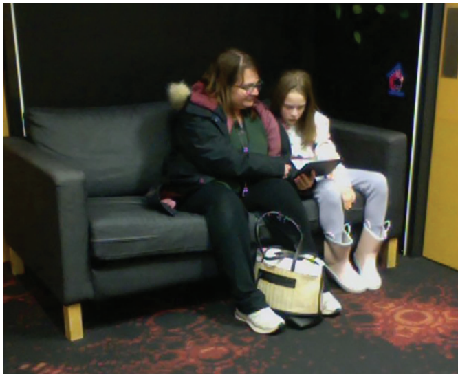
Figure One: 9-year-old child and her mother watching Australian animation Bluey together in the joint streaming session.

Children do not preference Australian content, with only 17.1% choosing Australian content as a first choice in their independent streaming sessions. Even fewer (9.4%) chose Australian content in the joint session with parents. This highlights that parental influence does not necessarily guide children towards Australian content.