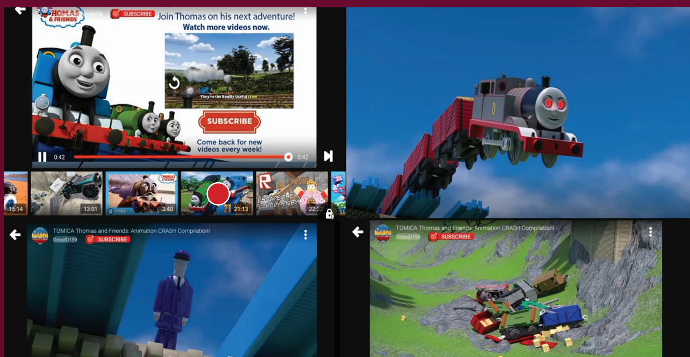
Figure Six: Screen-recording captures of 7-year-old boy finding a problematic video on YouTube Kids through recommendations – red circle in top left image captures the child selecting the video from the "more like this" queue after watching an official Thomas & Friends video. The child had previously developed this route to content at home.