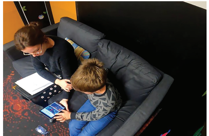
Figure Five: 8-year-old boy “showing and telling” the researcher how he navigates interfaces across multiple platforms to find content.