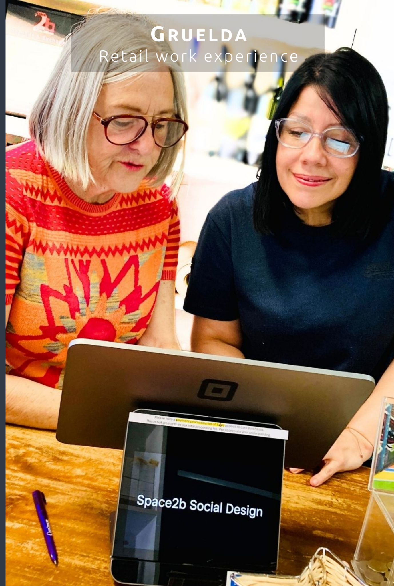
GRUELDA Retail work experience