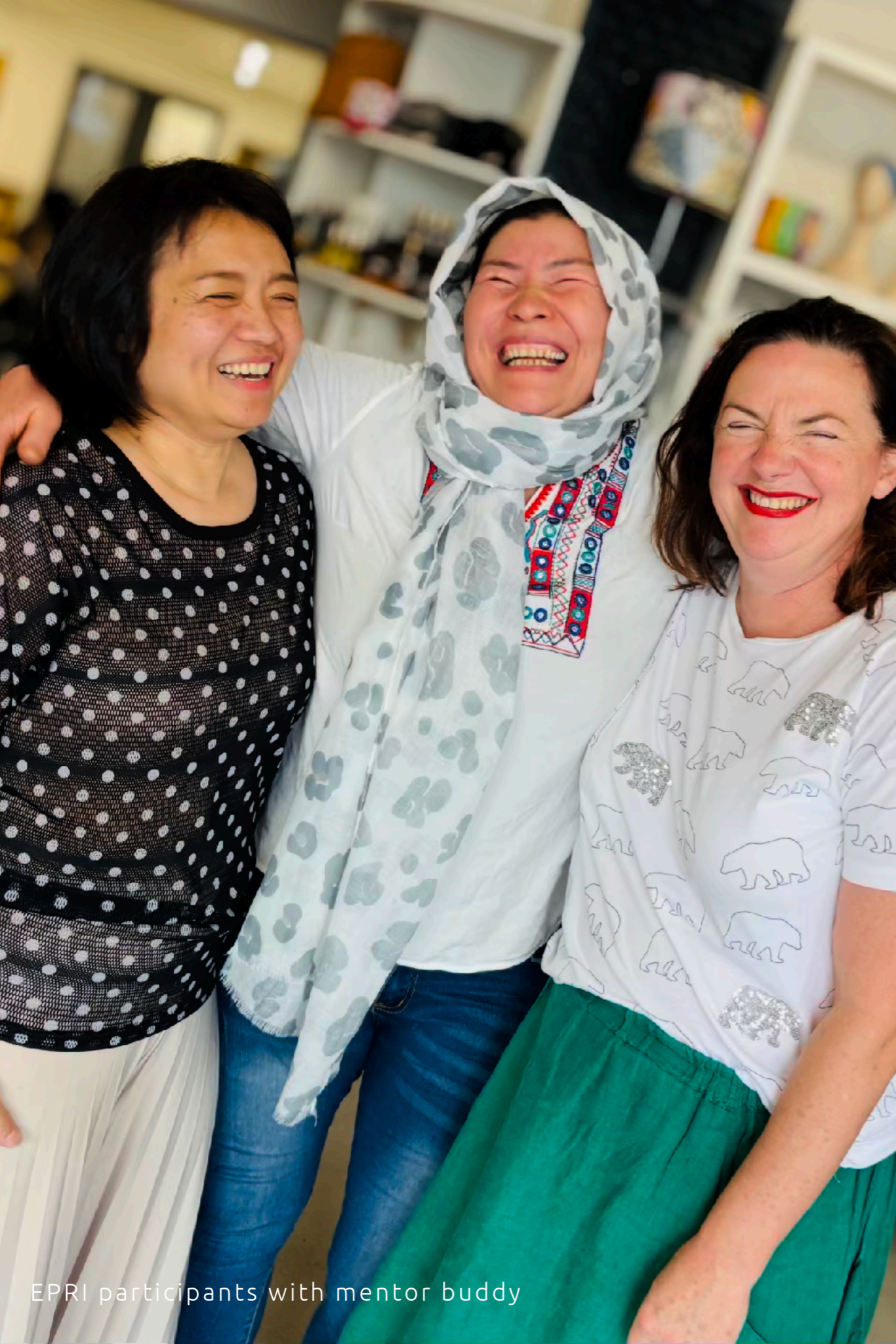
EPRI participants with mentor buddy