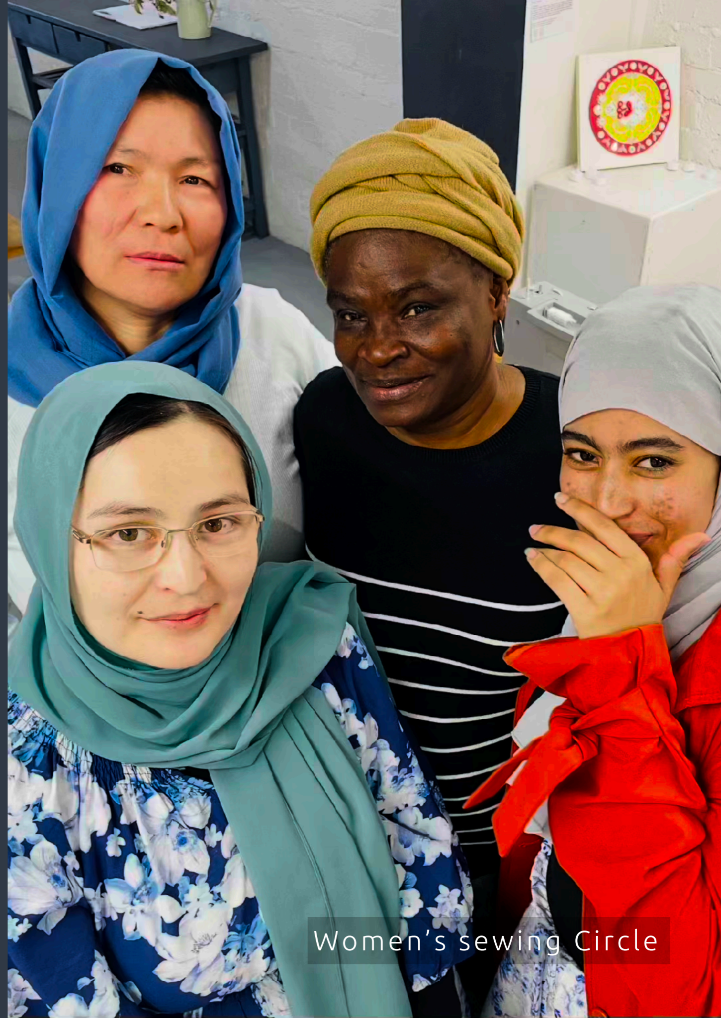
Women's sewing Circle

$13,580 Volunteer financial annual contribution ($45/hr)