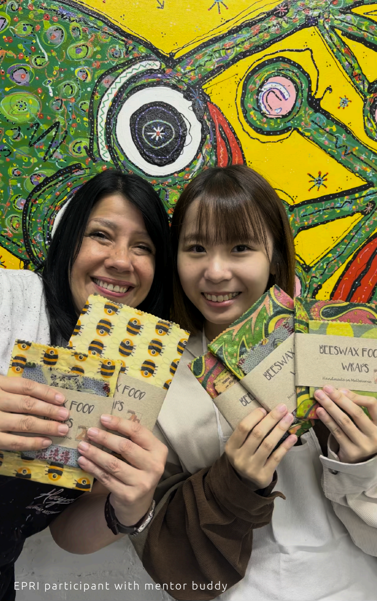
EPRI participant with mentor buddy