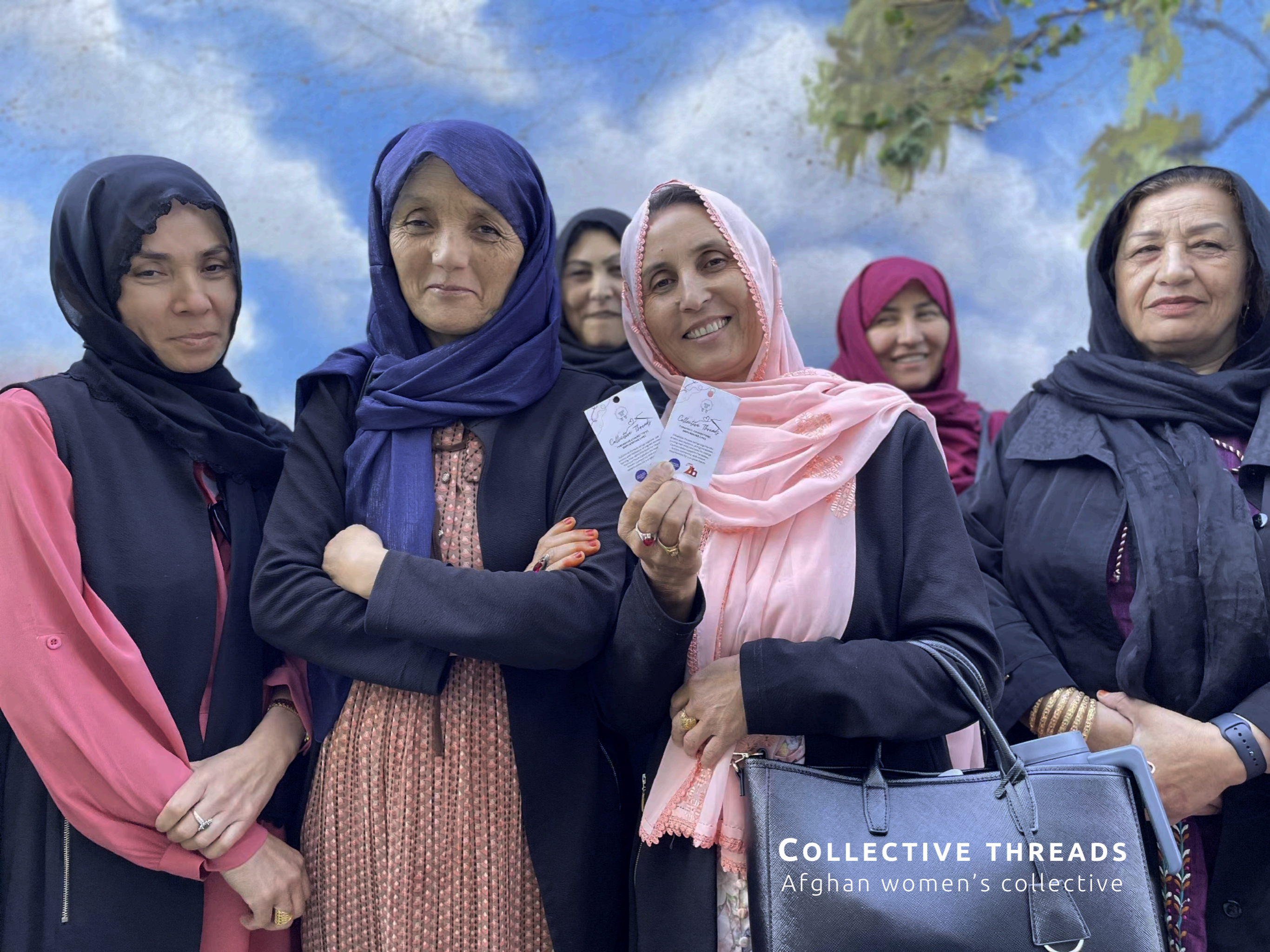
COLLECTIVE THREADS Afghan women's collective